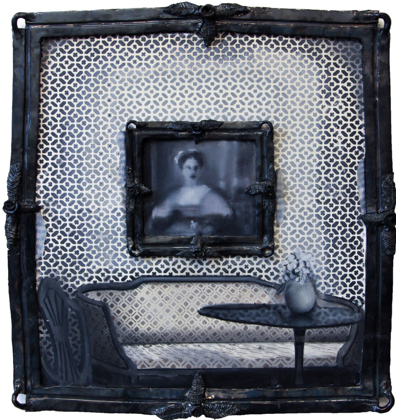
Pensive visitant, 2023, 82 x 76 cm, oil and acrylic paint on canvas mounted on dibond, ceramic frames