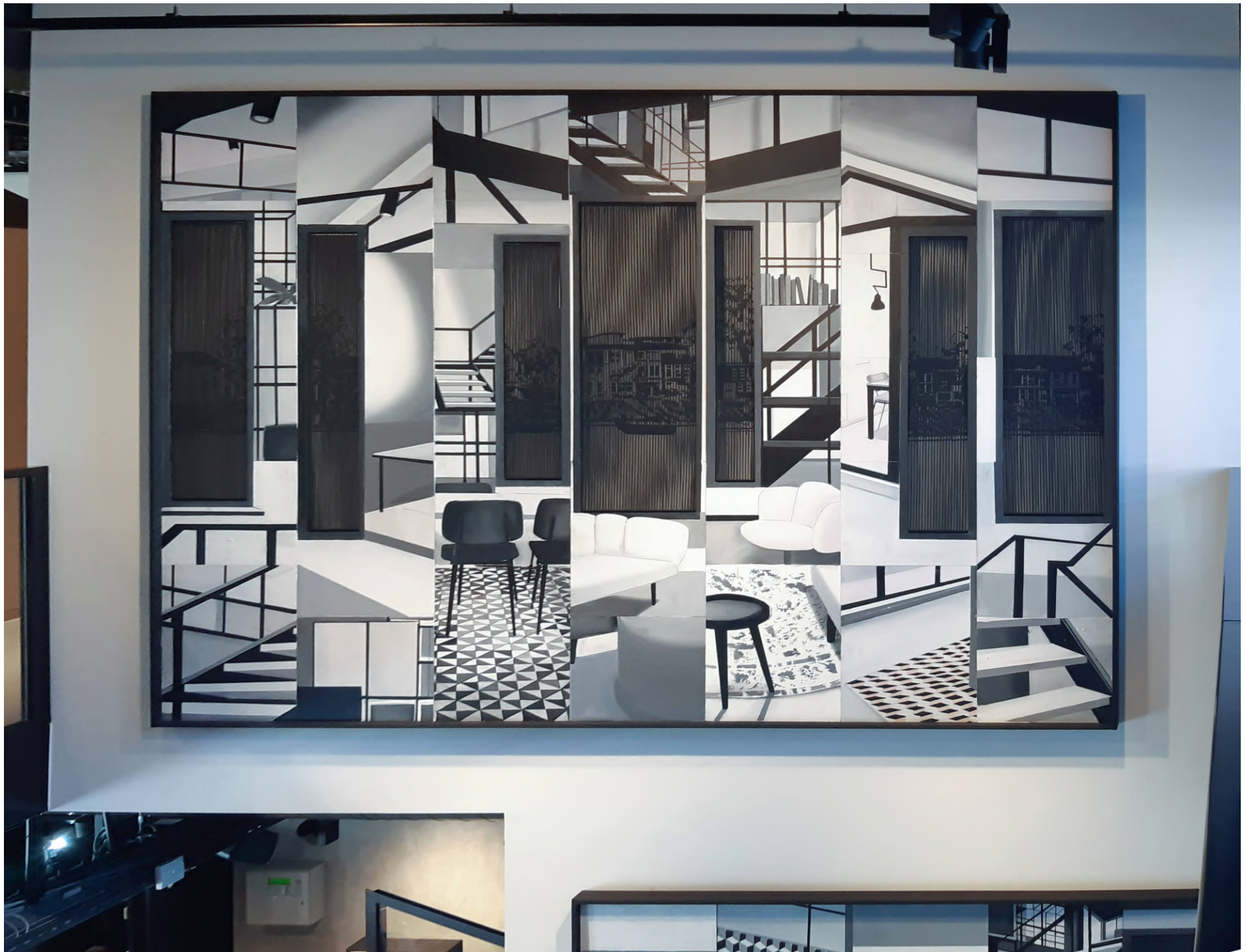
'Staircase painting', 2020, 220 x 350 cm, silk screened paper, black threads, oil and acrylic paint on wood