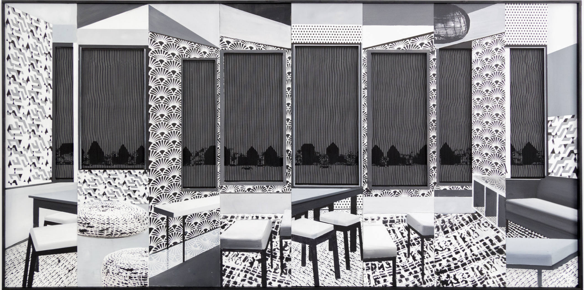
'Paragon Properties', 2020, 200 x 400 cm, silk screened paper, black threads, oil and acrylic paint on wood