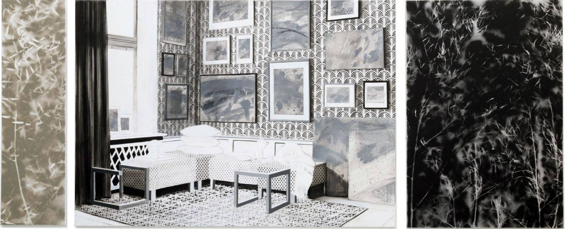
'Tryptic with black and white interior', 2016, 500 x 200 cm, oil, acrylic and spraypaint on canvas and linen