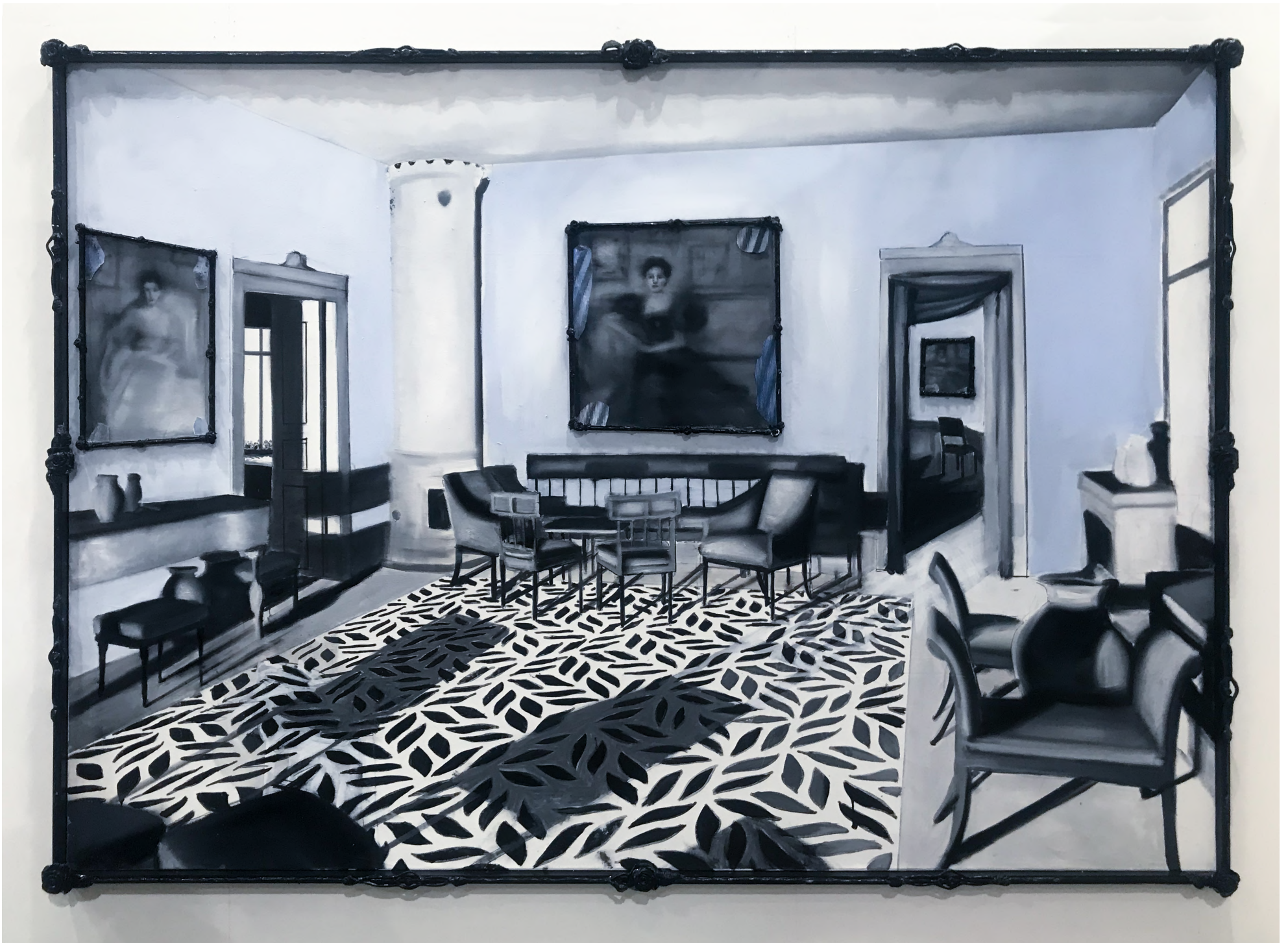
Cedar Remiscinance, 2023, 184 x 244 cm, oil and acrylic paint on canvas, resin, wood and resin clay frames