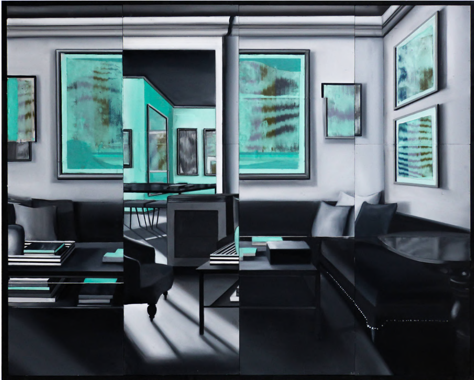
Hallway series, 'Opening', 2021, 160 x 200 cm, epoxy, oil & acrylic paint on wood