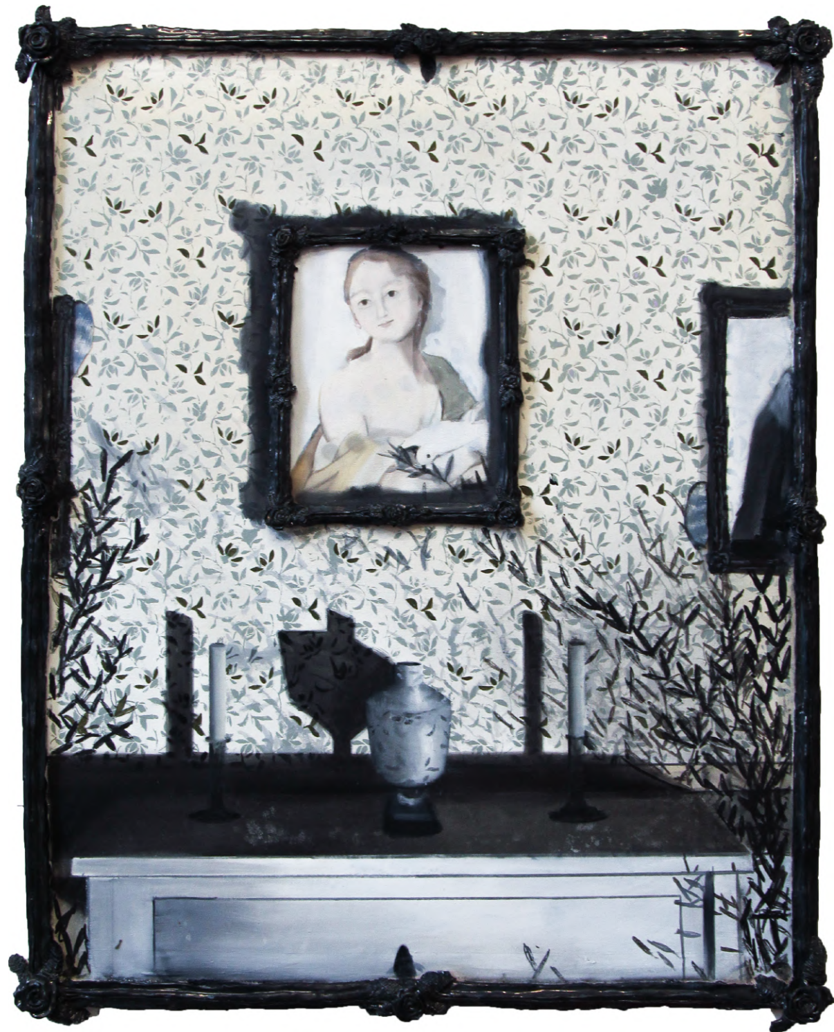
Innocent endowment, 2023, 103 x 80 cm, oil and acrylic paint on canvas mounted on dibond, ceramic frames