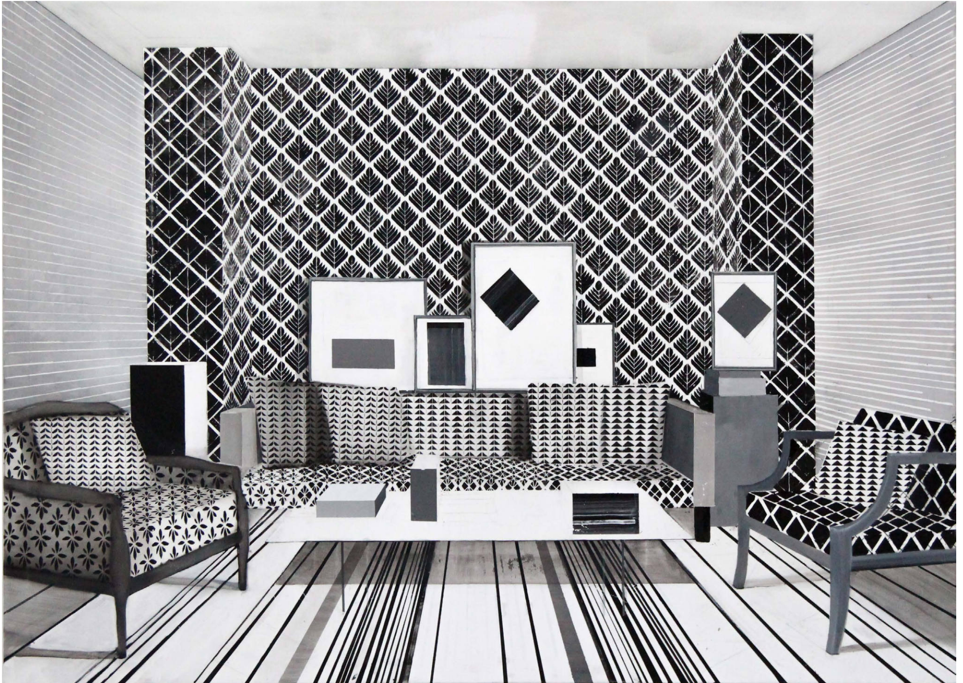
'Eclectic Living I', 2017, 180 x 200 cm, oil and acrylic paint on canvas