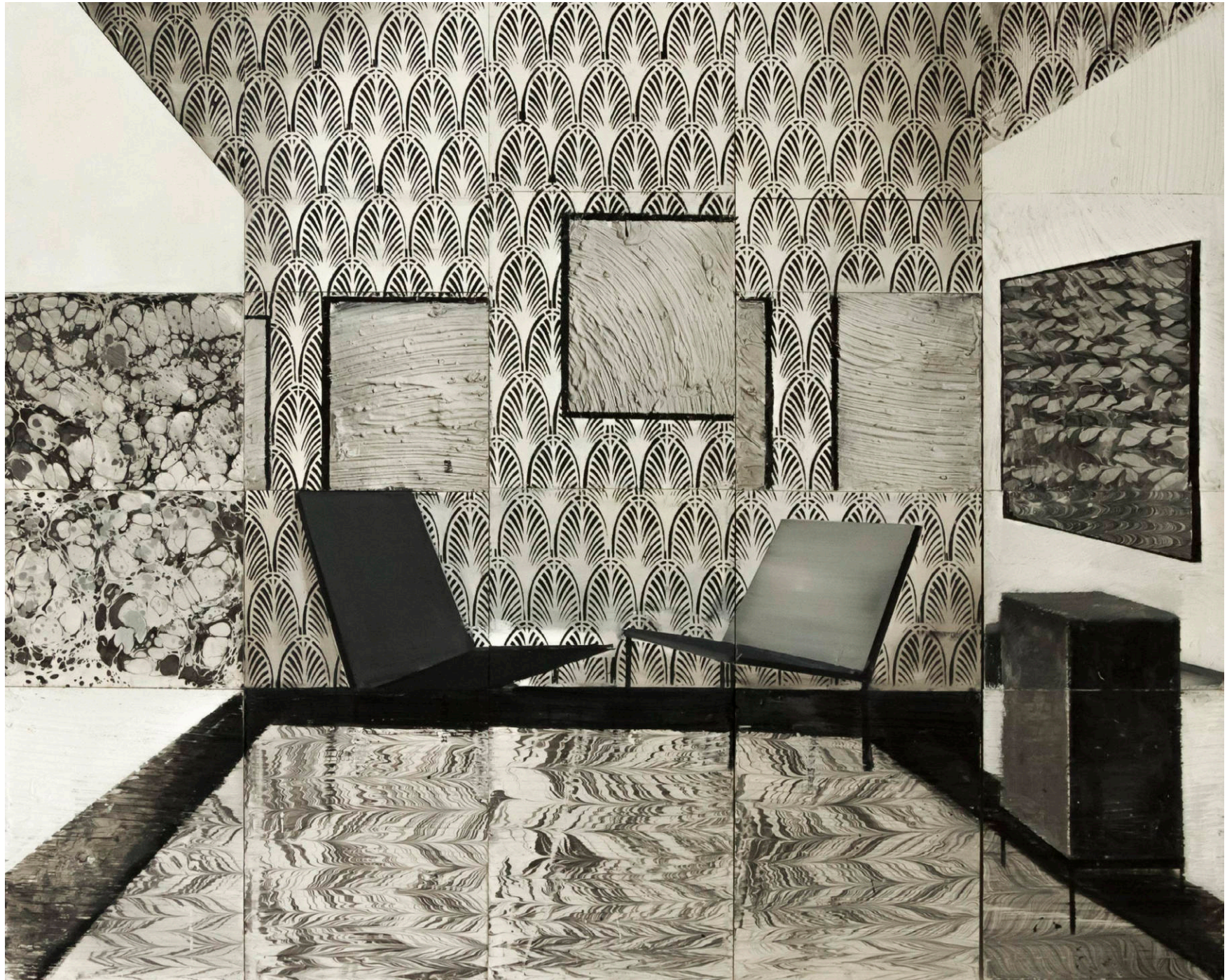
Untitled, 2018, marbled waterpaint, ink, plaster, oil and acrylic paint on wooden panels