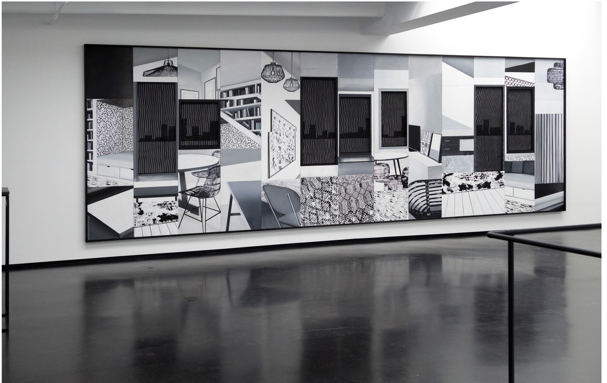
Size view 'Moonlit Isles', 2020, 220 x 650 cm, silk screened paper behind black threads, oil and acrylic paint on wood