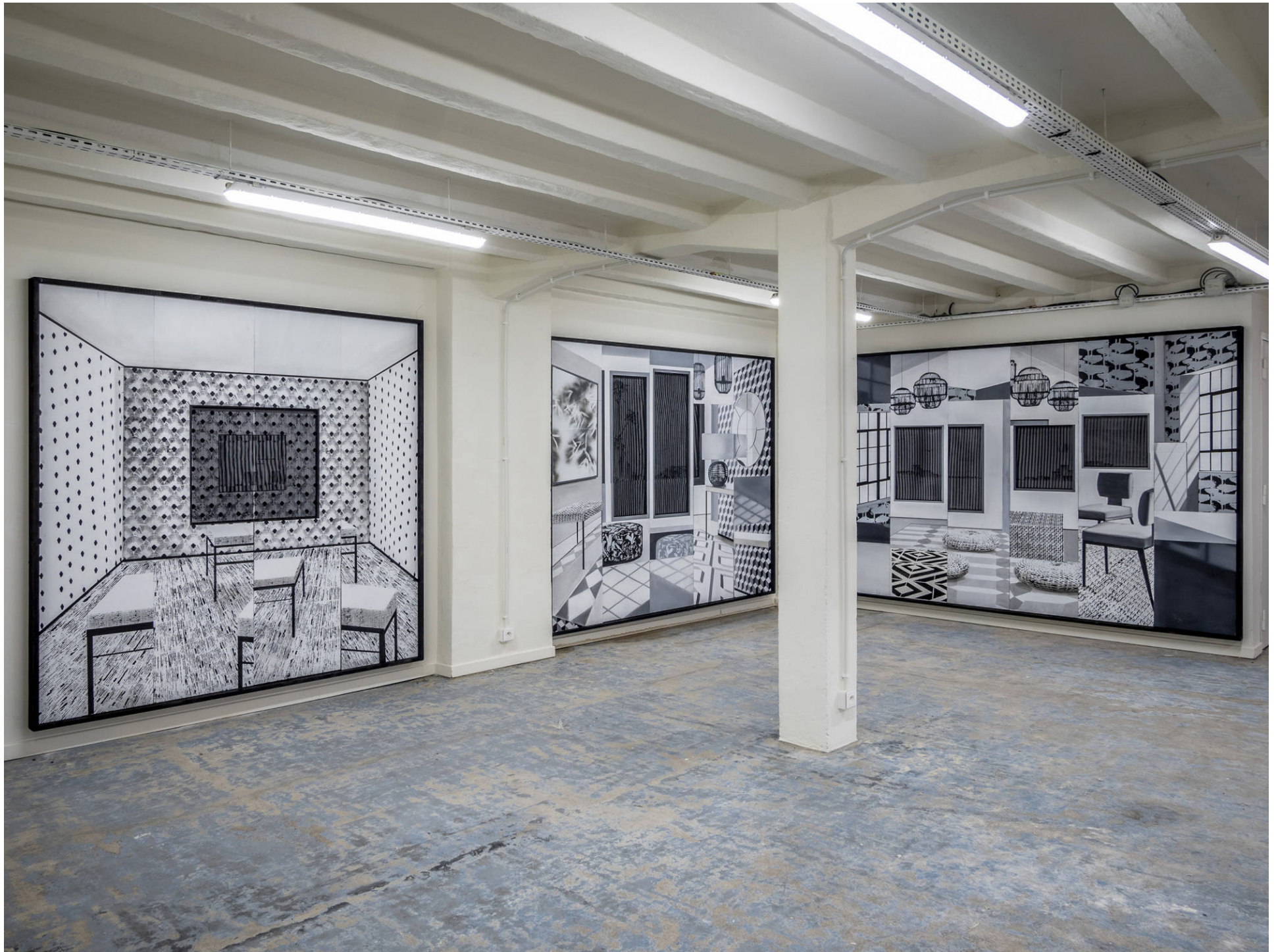
Overview 'Lost and found in Paradise' ARTUNER, Parijs 2019