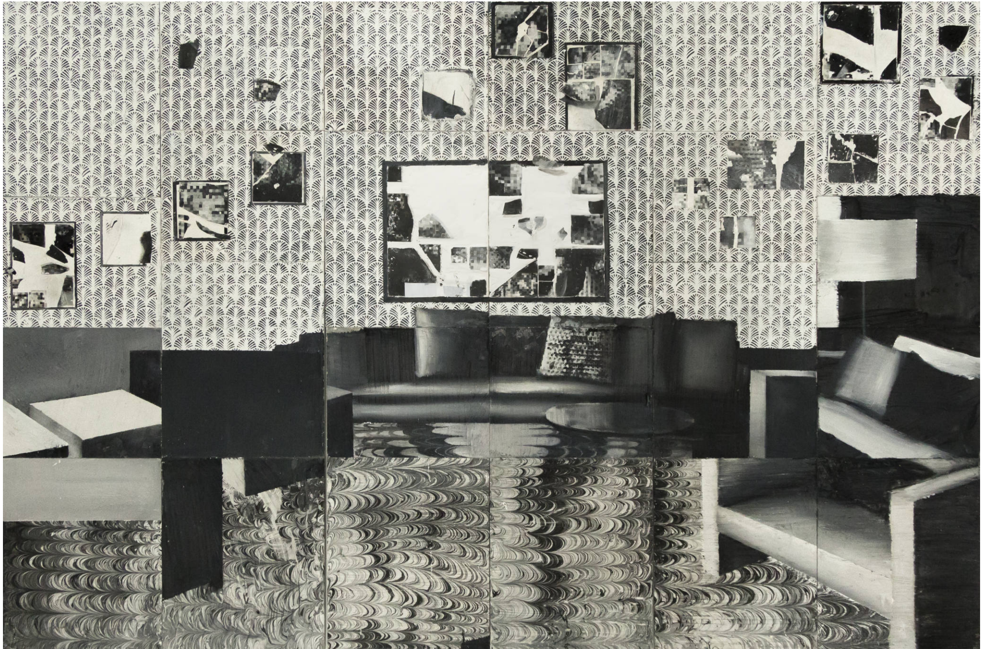
'Covert Motion', 2018, marbled waterpaint, ink, plaster, ceramic tiles, oil and acrylic paint on wooden panels