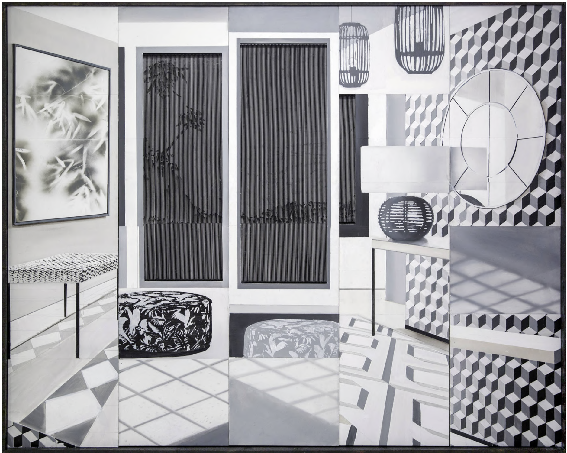
'Elysian Inn', 2019, 200 x 250 cm, silk screened paper, black threads, oil and acrylic paint on wood