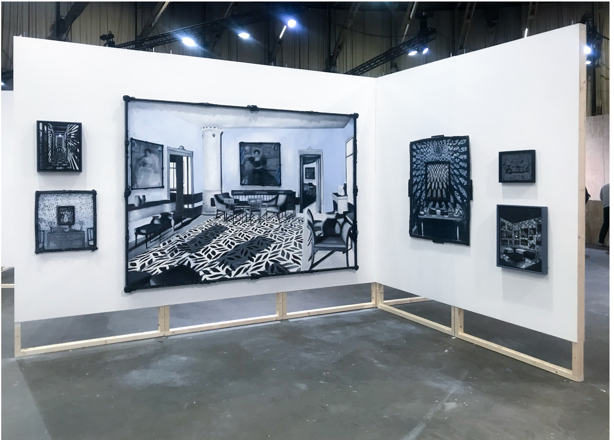
Overview Unfair Amsterdam 2023