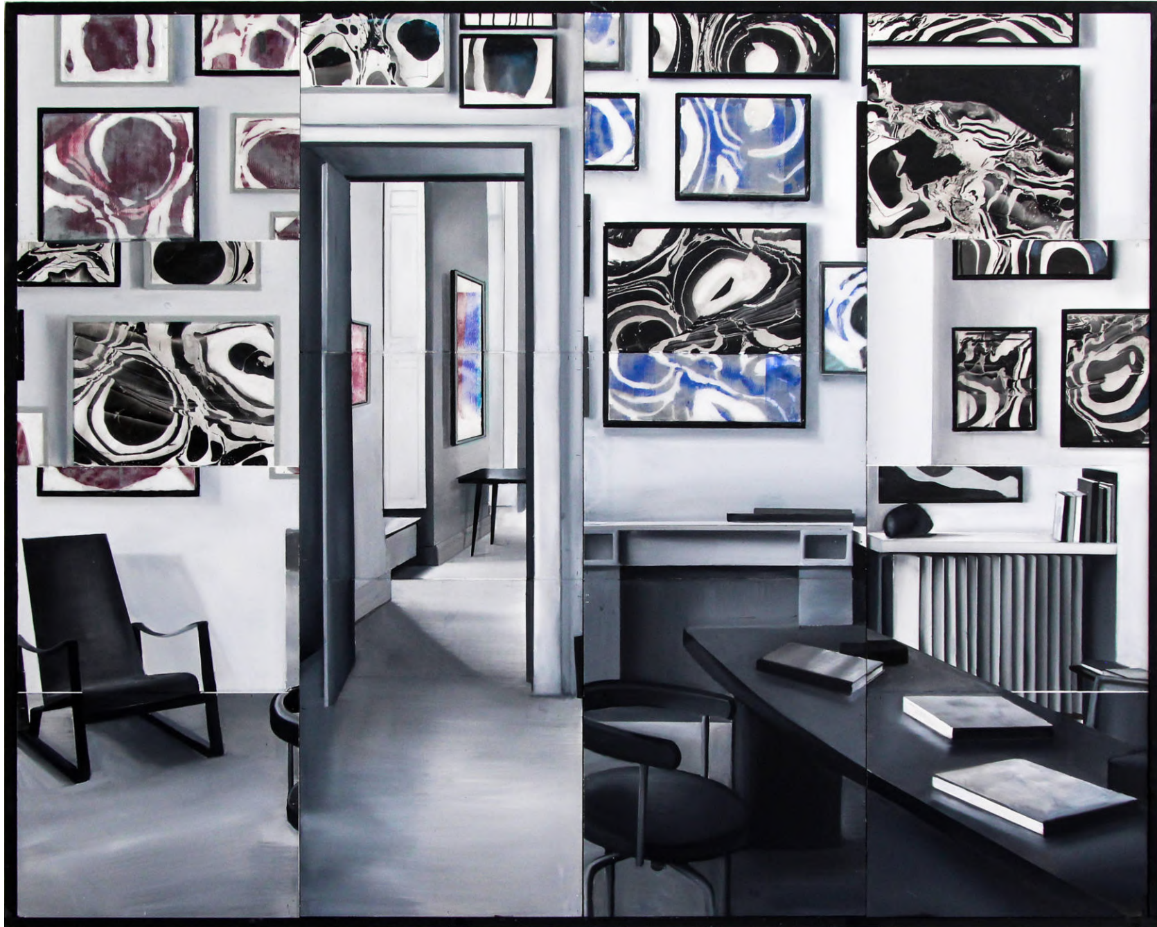
Hallway series, 'Inward hues', 2021, 160 x 200 cm, epoxy, oil & (marbled) acrylic paint on wood