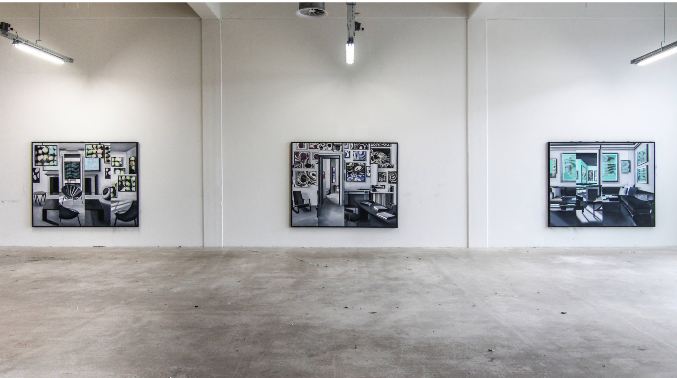
Studio view 'Hallway series', 2021 ( link for small impression of materials used)