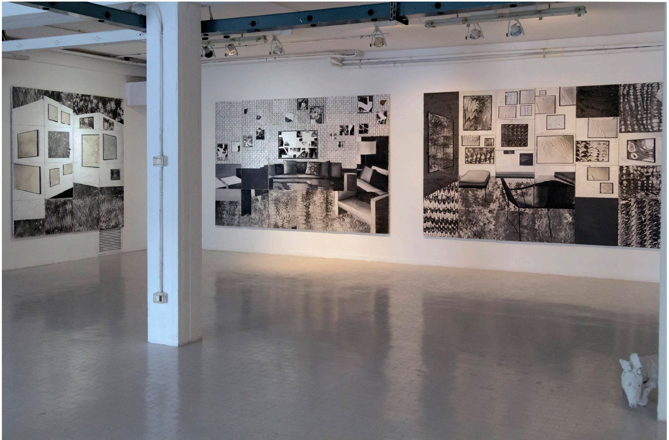
Overview Covert motion, 2018, Artericambi, Verona