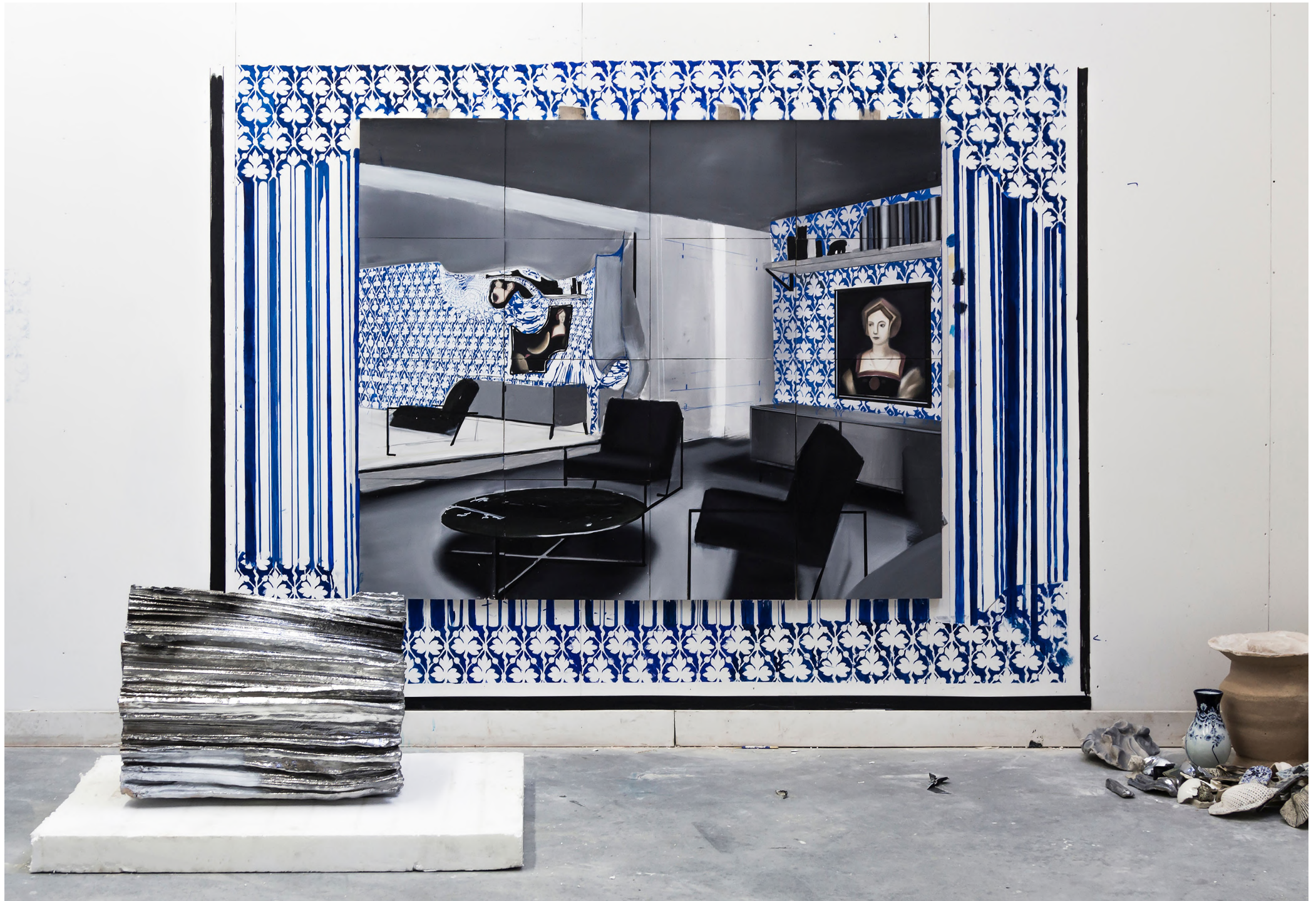
Detail photo installation in progress EWKC 2022