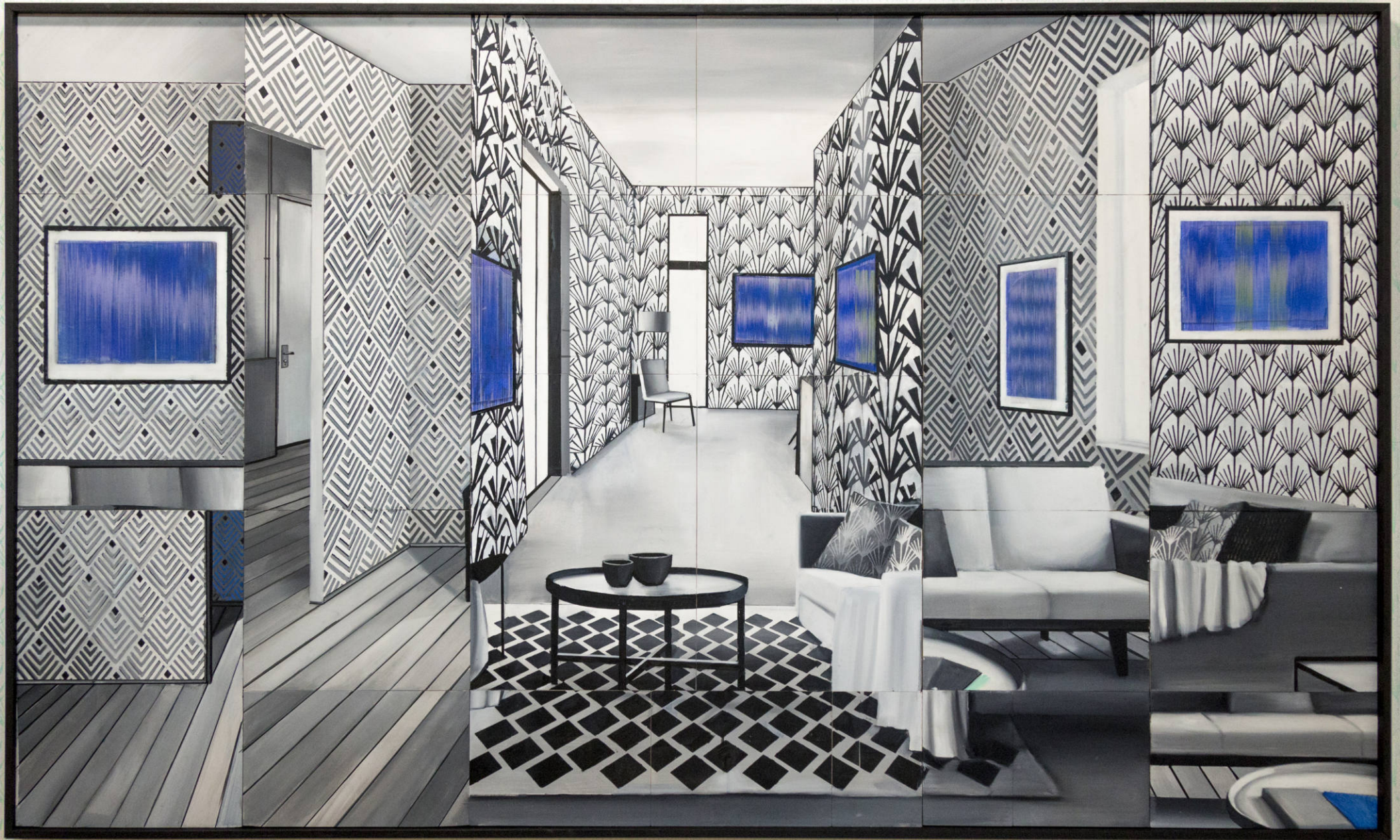
Novelized Blue, 2022, 170 x 300 cm, oil and acrylic paint on wooden panels, epoxy, light green wall painting in the back