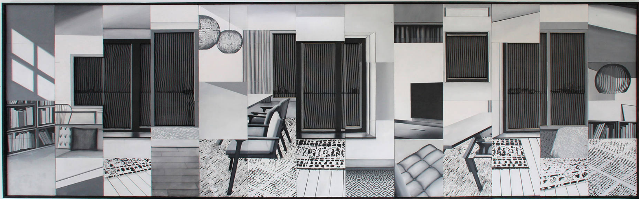
Overview in Cargo in Context. 'Brick Meadow', 2019, 200 x 600 cm, silk screened paper, black threads, oil and acrylic paint on wood