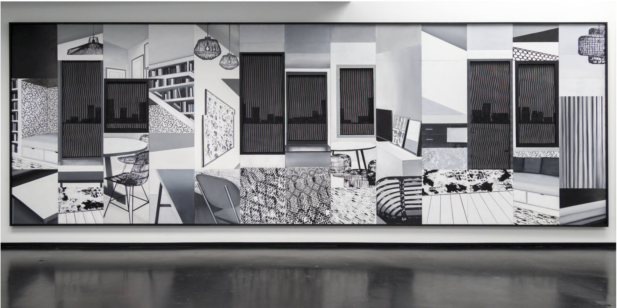
Overview in 38CC. 'Moonlit Isles', 2020, 220 x 650 cm, silk screened paper, black threads, oil and acrylic paint on wood