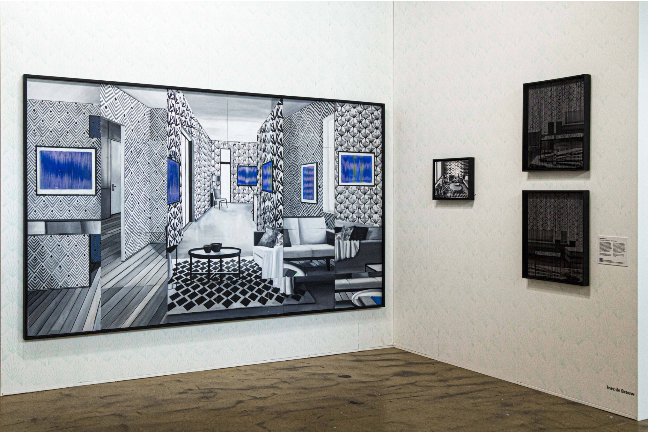
Overview 'Novelized Blue', 2022, NN Group Award Stand Rotterdam