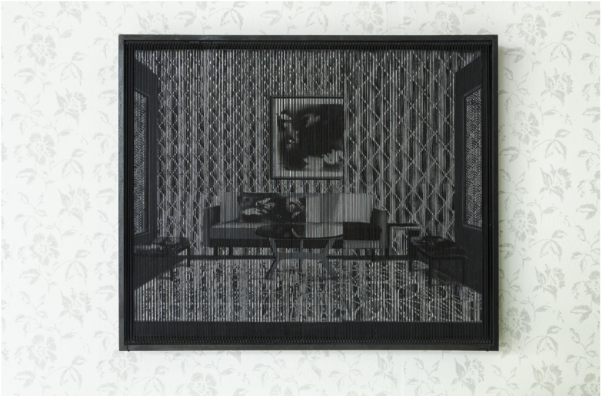
Velvet city, 2020, 50 x 60 cm, oil and acrylic paint on wood, black threads on lasercut acrylat ( link for small impression of material)