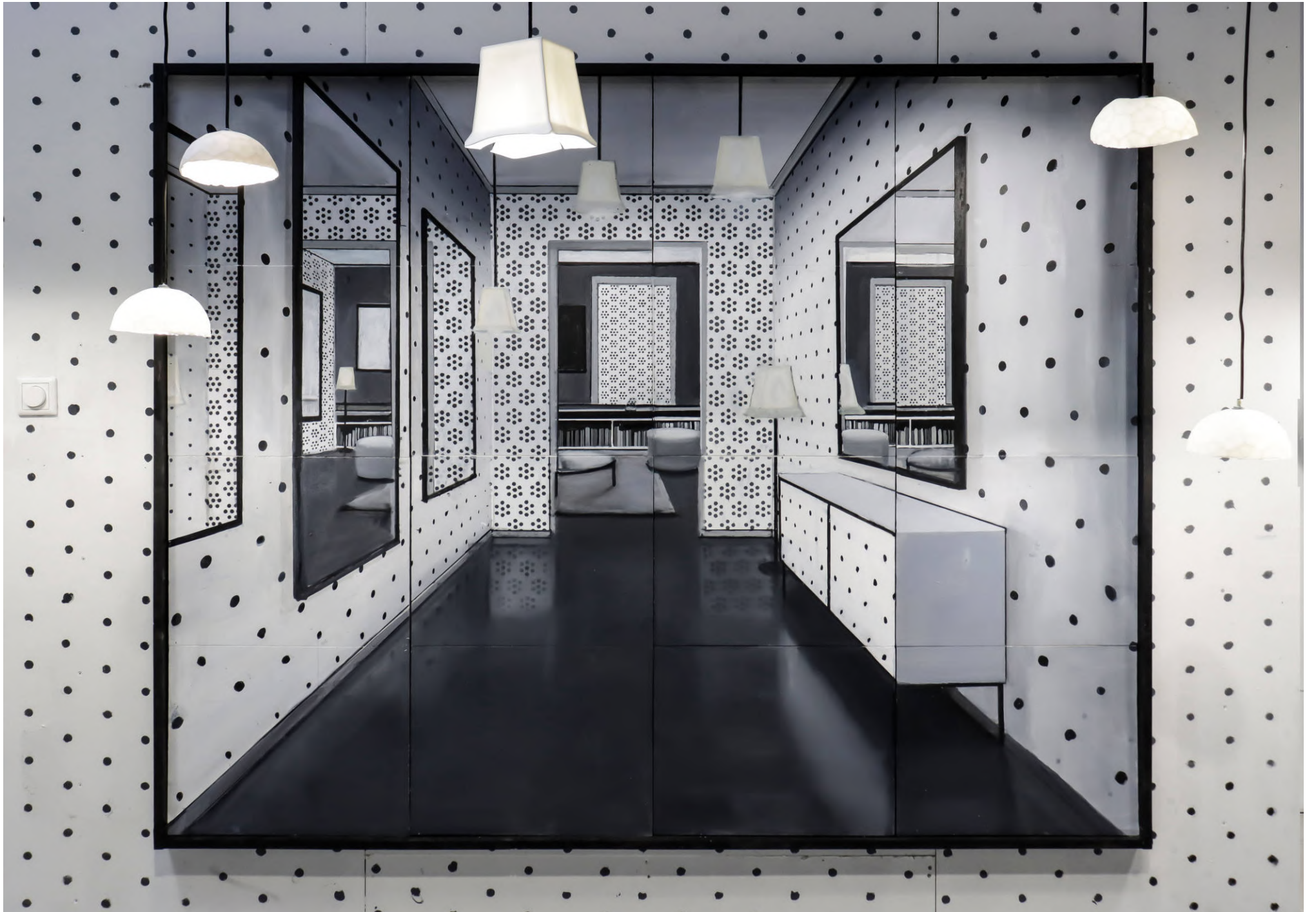
'Peripheral lights', 2023, (close up) at Testcase EKWC, Installation with painting on wooden panels (160 x 200 cm), wall painting (200 x 300 cm), porcelain lights (selfmade)