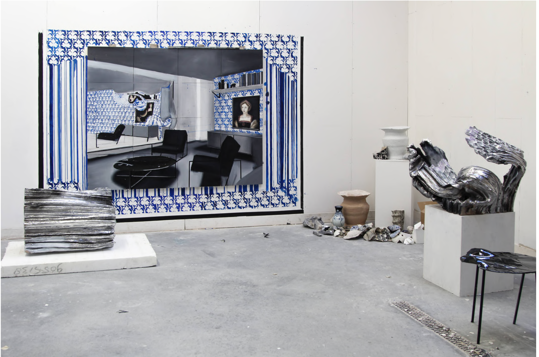
Installation in progress at EKWC Oisterwijk 2022, painting (160 x 200 cm), wall painting (200 x 310 cm) and ceramic sculptures (selfmade, stonewear, variable in size )