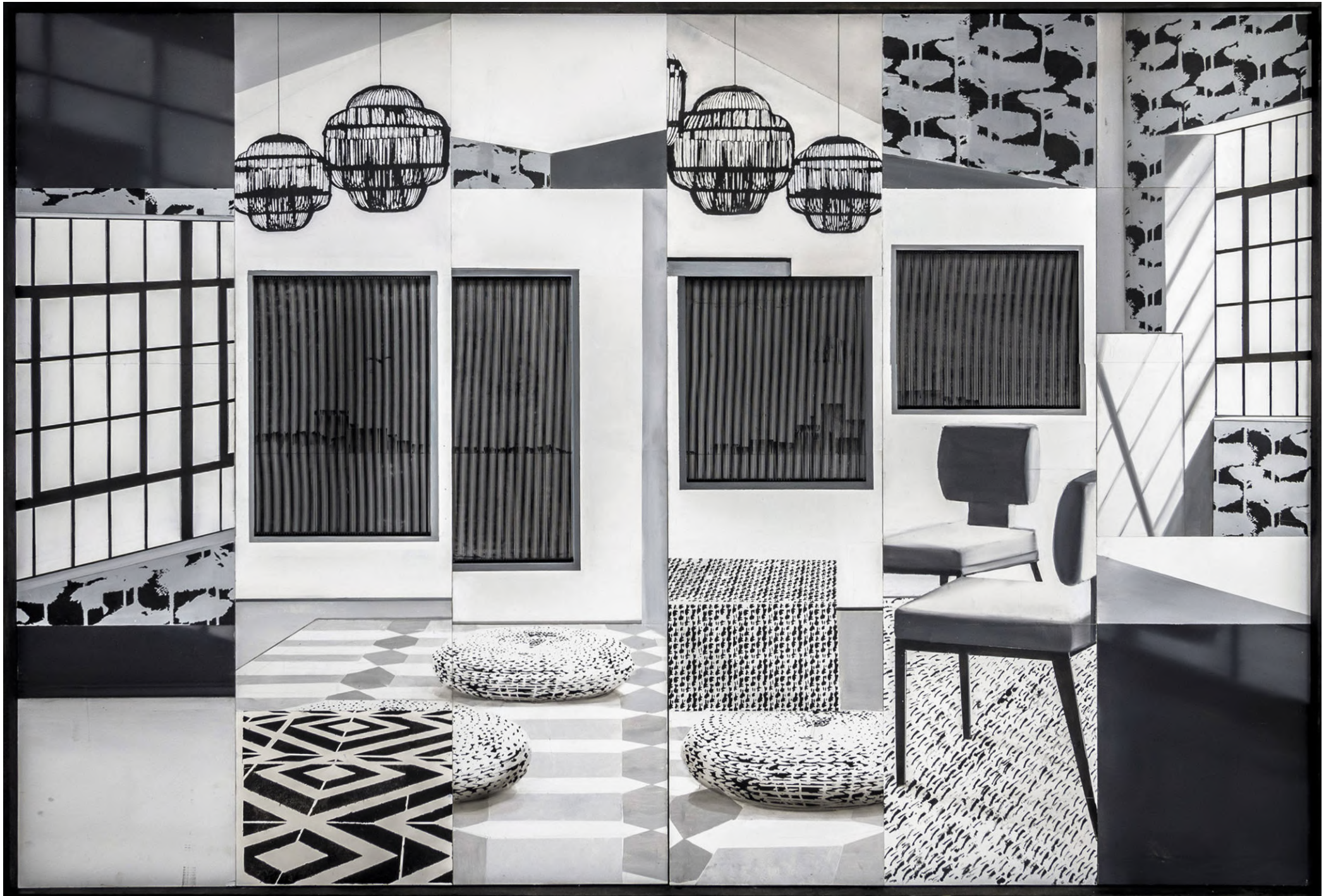
'Cedar aviary', 2019, 200 x 300 cm, silk screened paper, black threads, oil and acrylic paint on wood