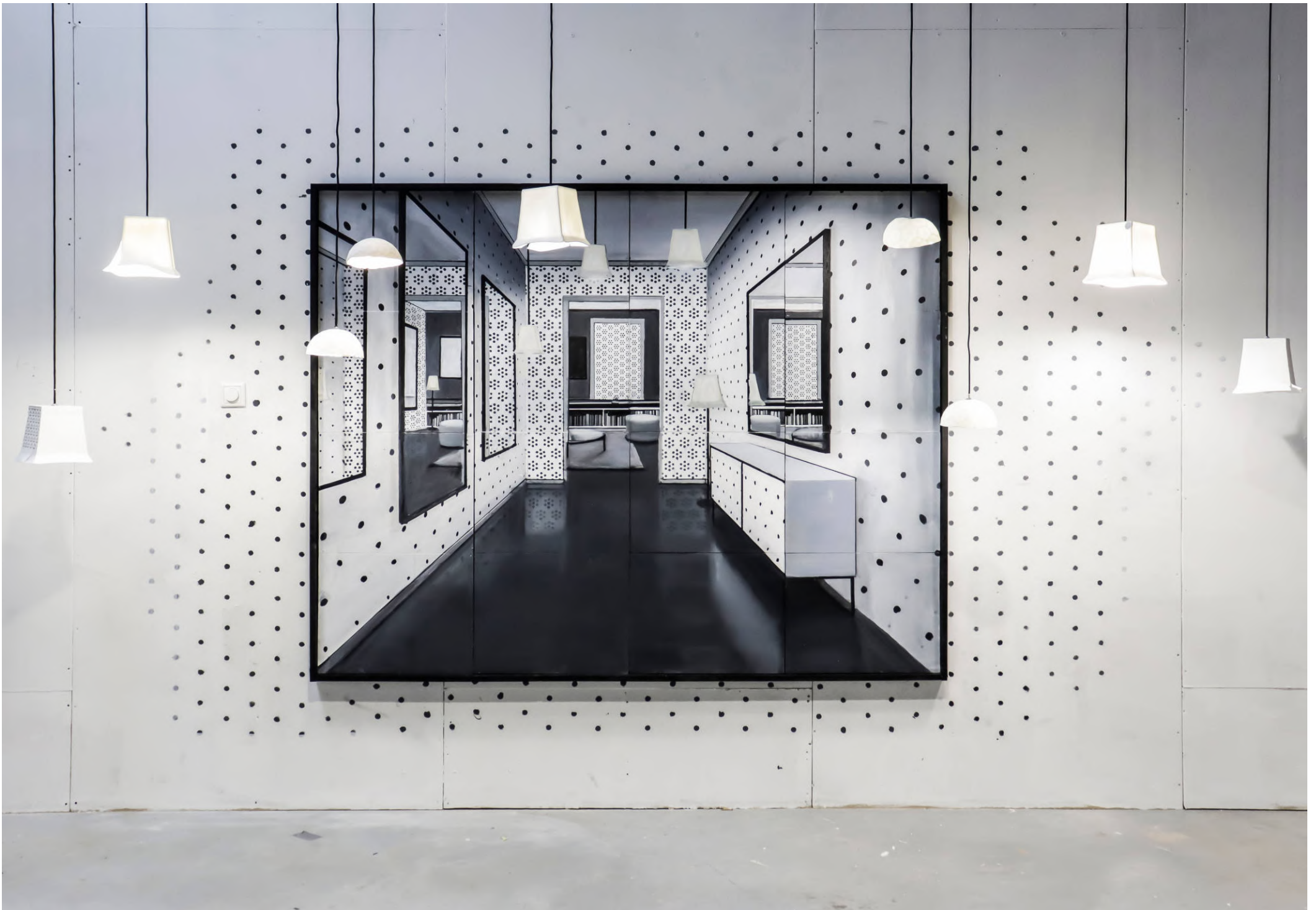
'Peripheral lights', 2023, Testcase EKWC, Installation with painting on wooden panels (160 x 200 cm), wall painting (200 x 300 cm) and ceramic lights (variable in size)