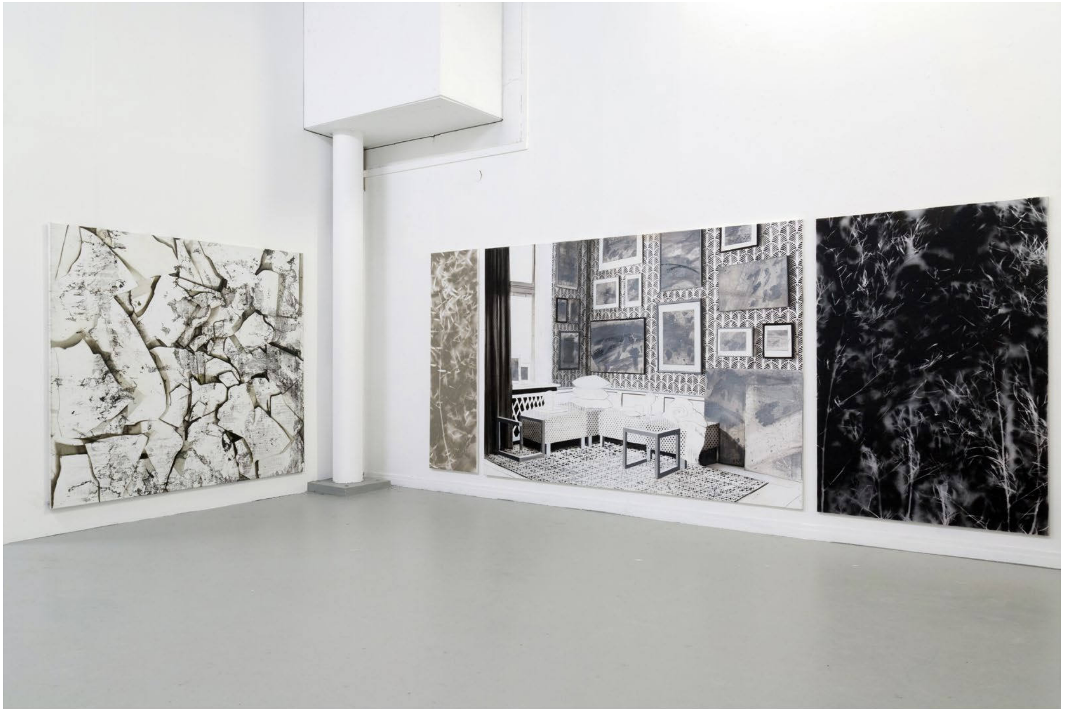
Overview, RijksOPEN 2016