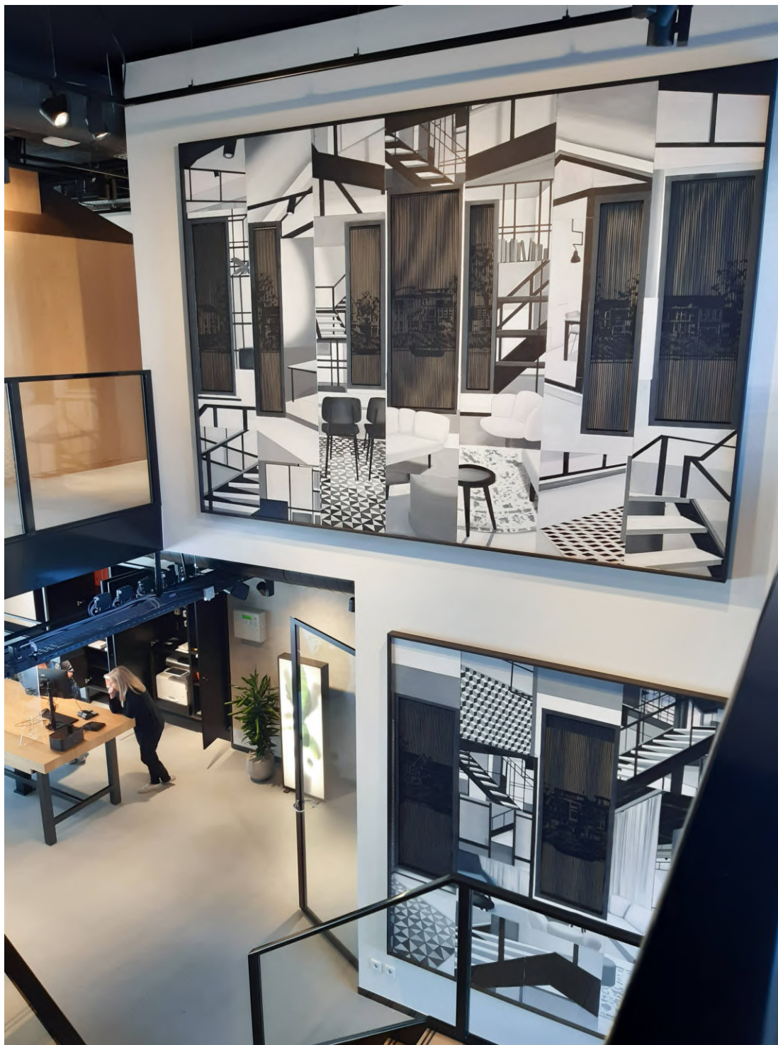
Overview 'Staircase Paintings, 2020, permanent installation ING, oil and acrylic paint on wood, silk screened paper, black threads,