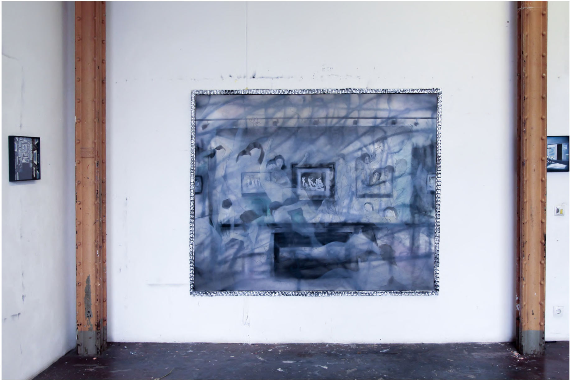
Installation view Open Studios Spinnerei Leipzig, residency LIA 2024