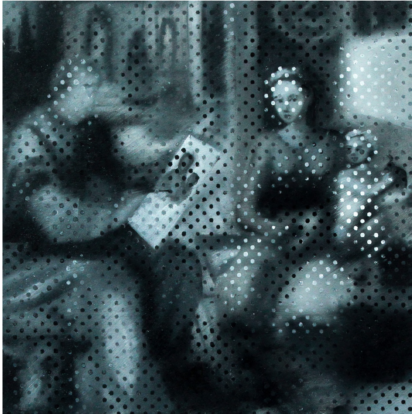
Saint Luke Reproduction Test, 2025, 40 × 40 cm, oil on canvas. The patron saint of painting, Saint Luke, paints the Madonna and Child. The faint black bird on the right in the original painting symbolised his ability to paint very naturalistically. I found this funny because the baby Jesus looked very ugly. In my version St Luke ends up in dots, as if they have landed in a pixelated reproduction for print.