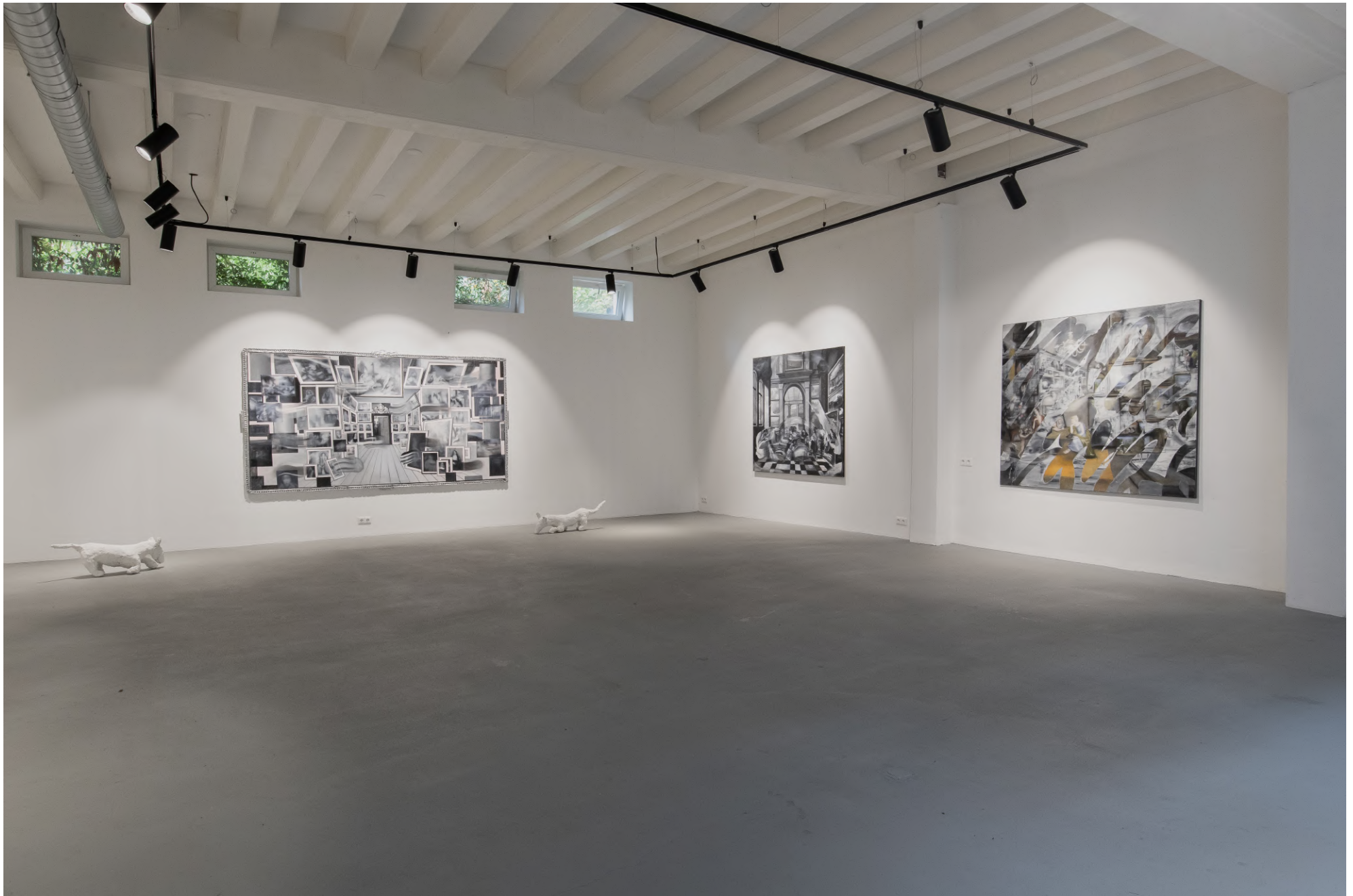
The Muse Withdraws, 2025 Installation view, Galerie Fontana.