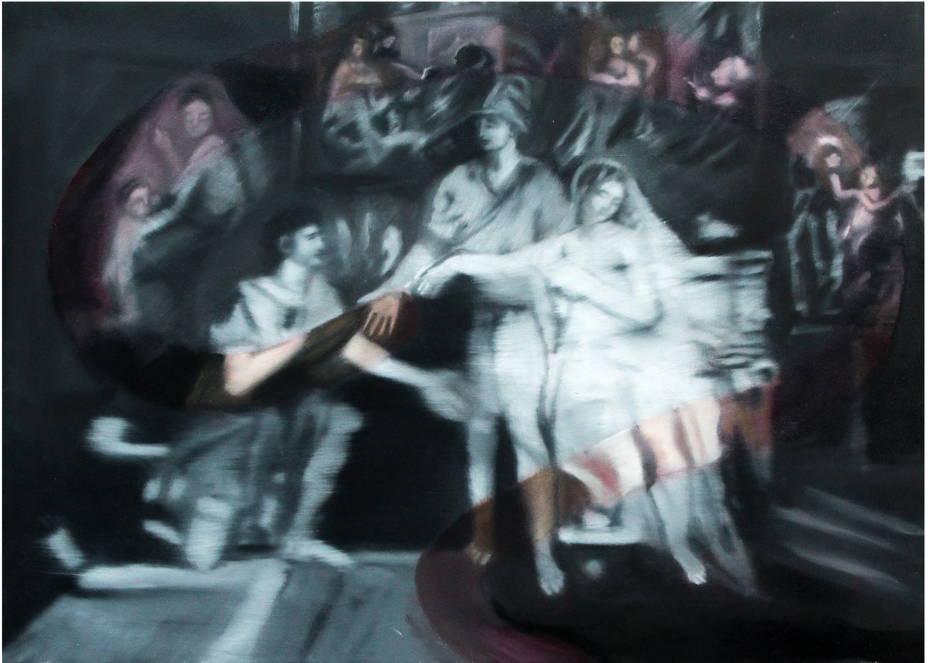
A Muse Unveils, 2026, 50 × 70 cm, oil and acrylic on canvas. After Alexander the Great Giving Campaspe to Apelles by Charles Meynier, 1822. Campaspe is Alexander's mistress. Apelles paints her and falls in love; she is given to him because the painting becomes more beautiful than she is. In my version she paints with colour across other existing depictions of Campaspe in the background. She highlights or reveals her own story, rather than being defined by it.