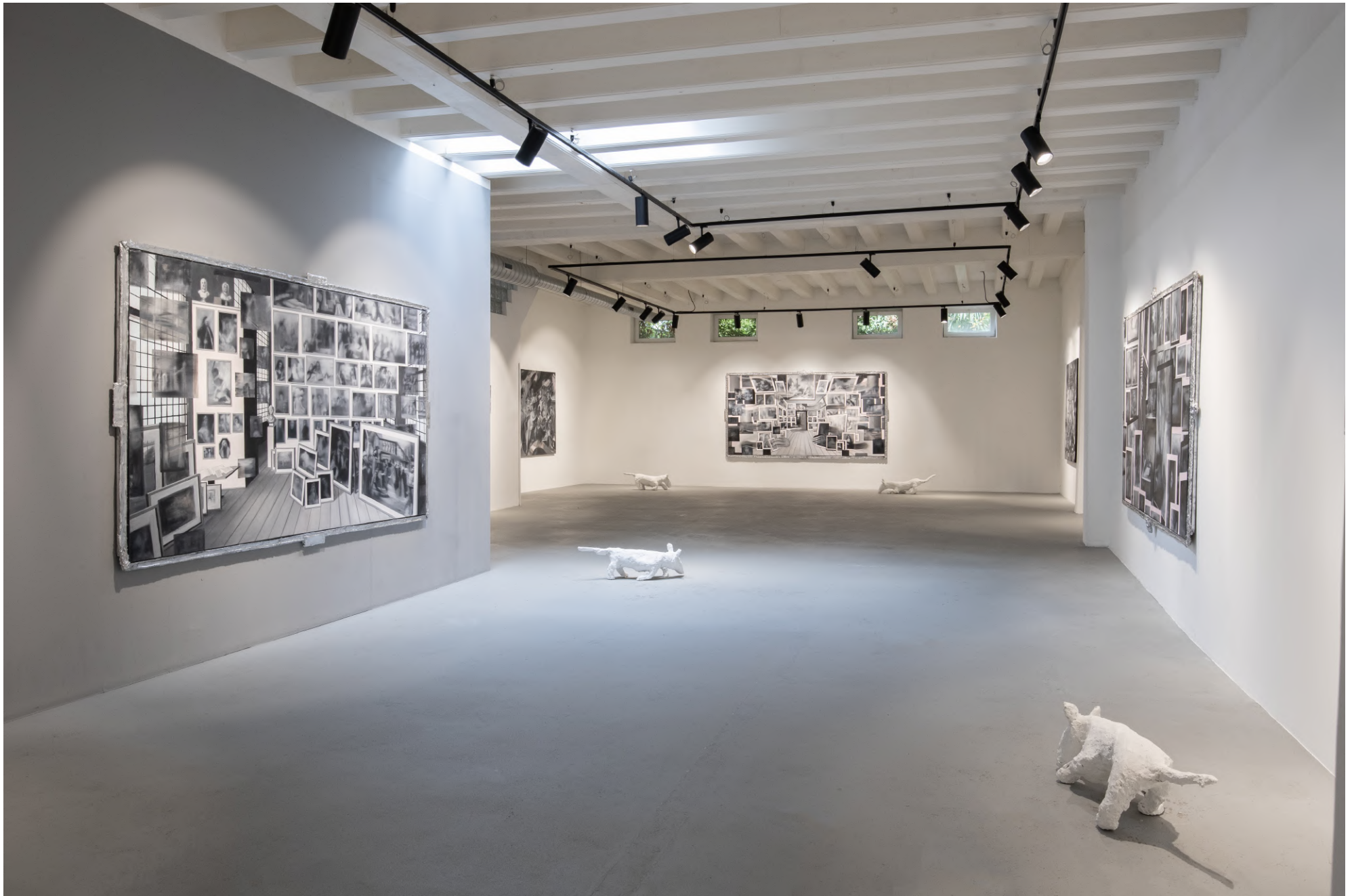
The Muse Withdraws, 2025 Installation view, Galerie Fontana.