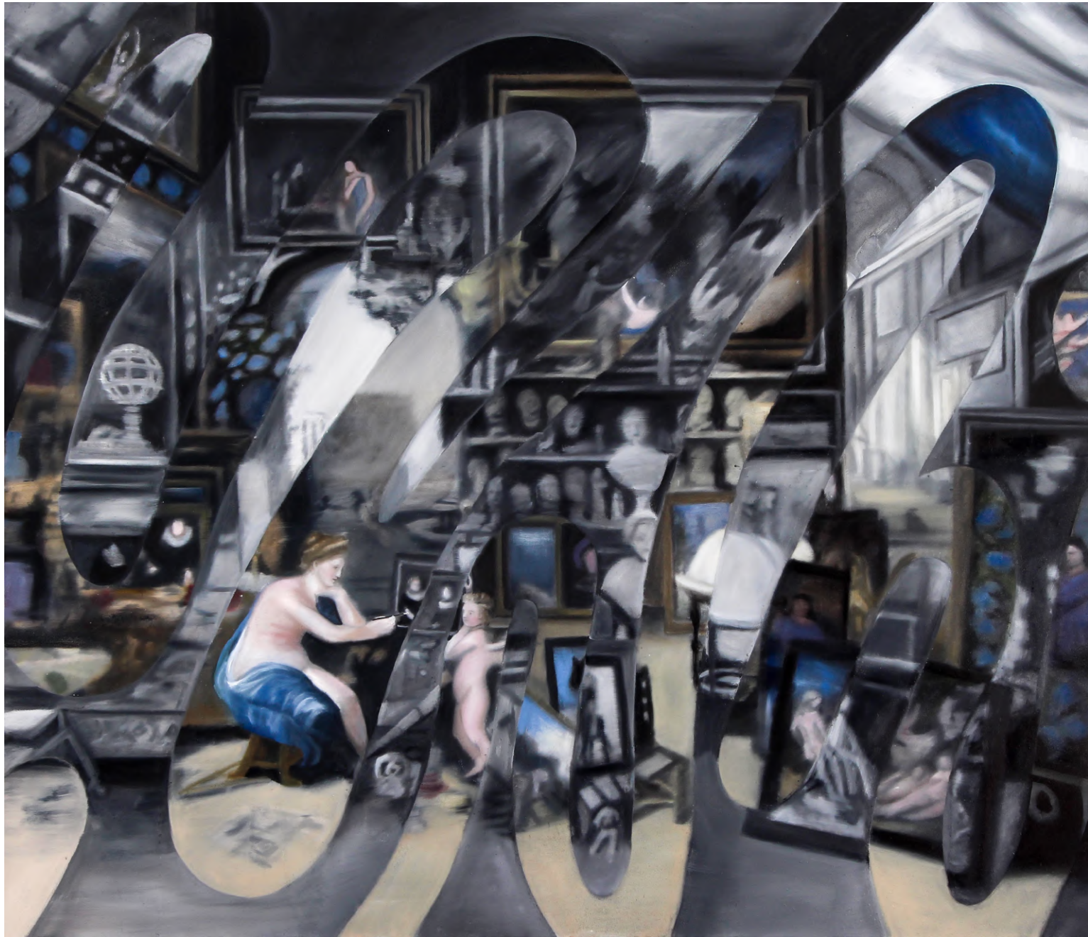
Parting Lovers - after Jan Bruegel the Elder and Rubens, Allegorie of sight, 1617 2026, 155 x 180 cm, oil and acrylic paint on canvas (See After Departure for information)