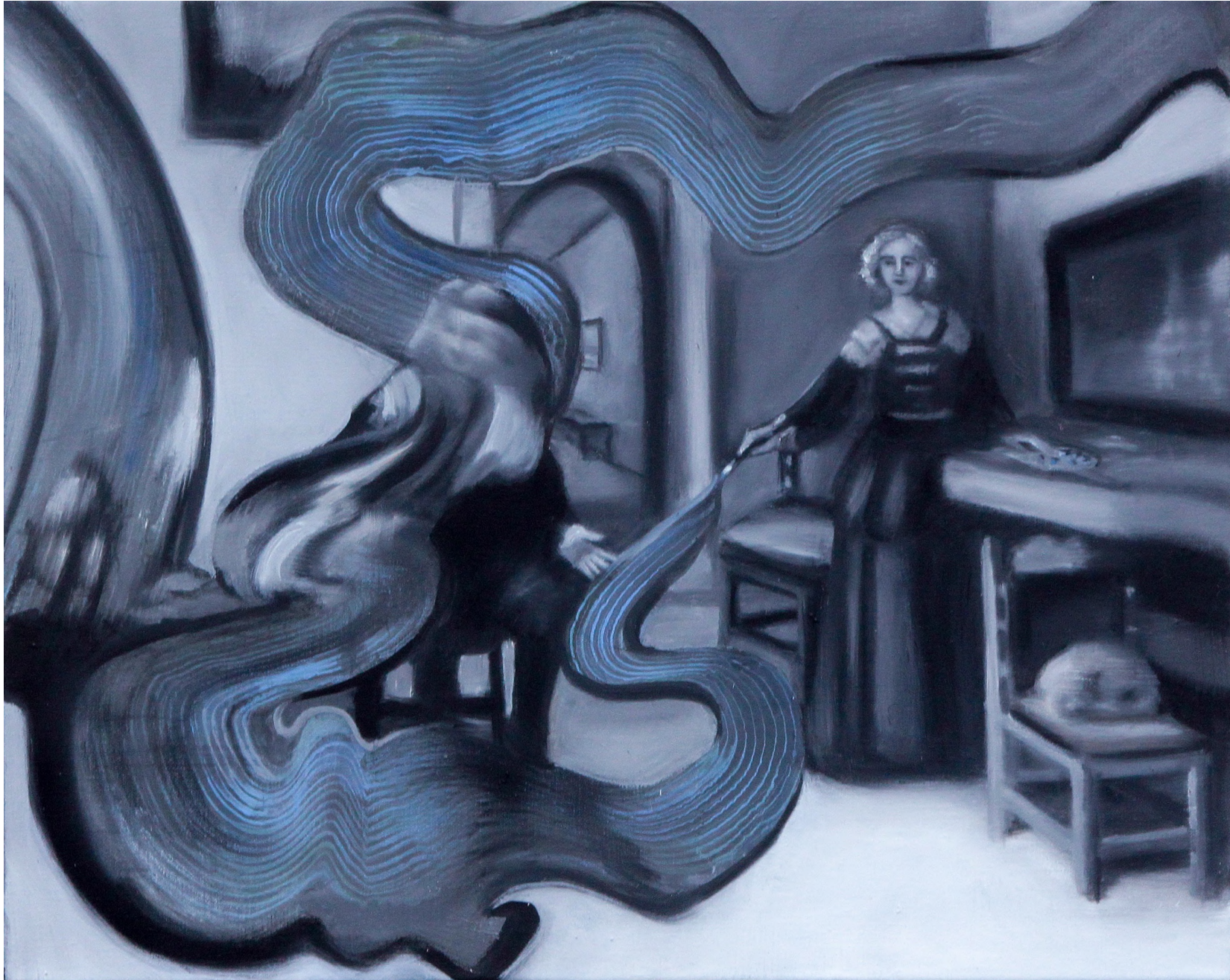
This painting is based on Portrait of a Learned Gentleman and His Wife (1640) by Gonzales Coques. I empathized with the woman on the right: expected to stand behind such an intelligent man - quiet, composed, and beautiful. In my version, the woman receives the brush, and with it, the power to complete the painting. Both the man and the symbols emphasizing his intellectual authority gradually fade under her "wish paint." Finally, she might think, there is rest.