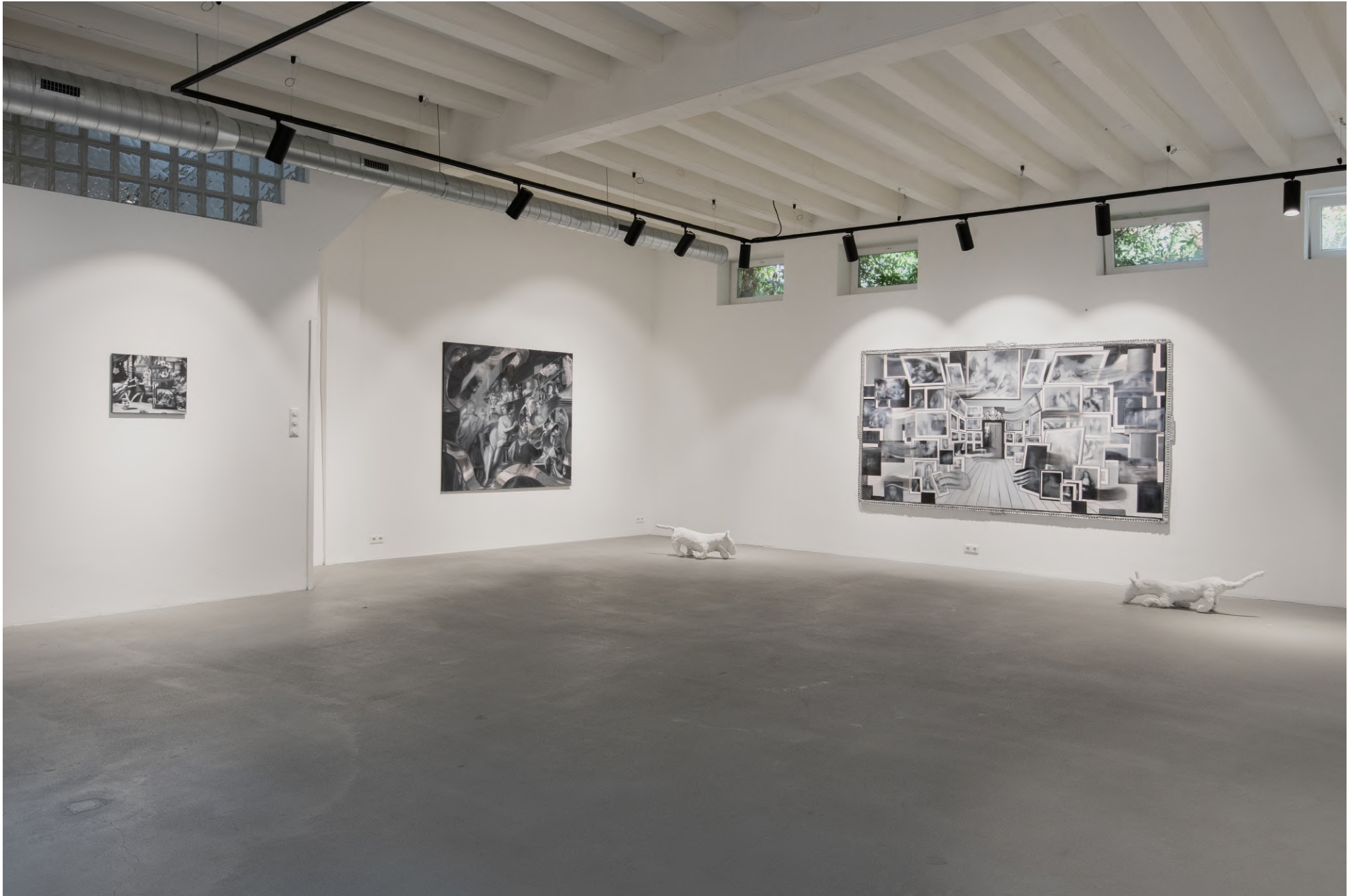
The Muse Withdraws, 2025 Installation view, Galerie Fontana.

A lot of 17th-century paintings have dogs accompanying female characters; they refer to good manners and chastity. These dogs on view, made of air-drying cement, are based on a Bull Terrier named Krijtje that my family owned when I was young. For me they refer to my own possible chastity and good manners.