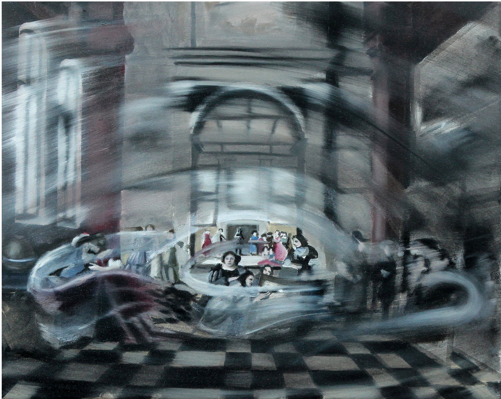
Between Framed Lines – Colour Study, 2025, 40 × 50 cm, oil and acrylic on canvas. Based on The Archdukes Albert and Isabella Visiting a Collector's Cabinet. In my version the man in the centre is erasing certain people.