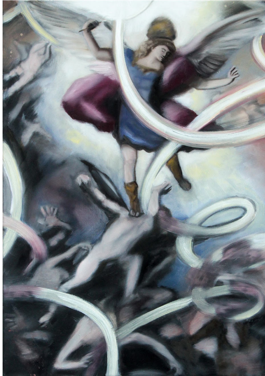
Michael Redacting, 2026, 70 × 50 cm, oil and acrylic on canvas. After The Fall of the Rebel Angels by Luca Giordano, 1666. In the original, Archangel Michael overpowers Lucifer and the demons during the War in Heaven. In my work, Good paints Evil; without faces. Again it is about who gets the brush and therefore the power to construct the story. I was thinking about contemporary geopolitics and the news. By removing identity, figures disappear more easily into history and become “the other”. Michael becomes a kind of rainbow warrior in my version. I am personally drawn to the naïveté in the original image.