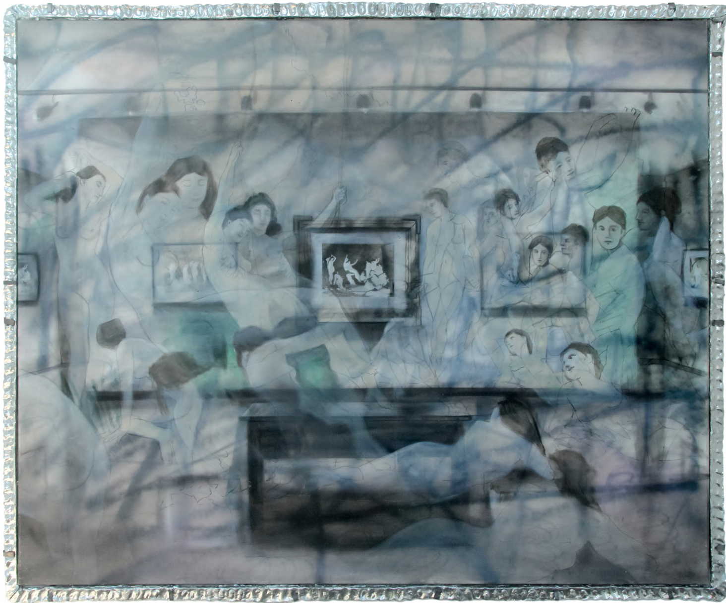
The viewing rooms - Soft Stories, 2024, 155 x 180 cm, oil and acrylic paint on canvas, mixed media frame After The Nymphaeum by Bougereau. I removed the peaking male satyrs from the original painting and let the women loose, playful and unbothered within a museum setting