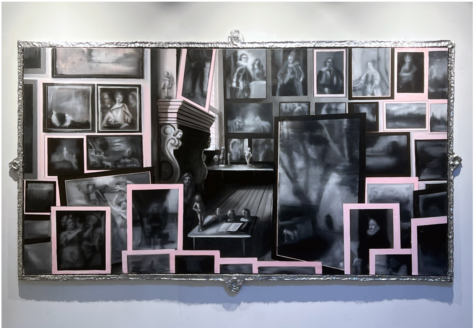
After Teniers – Establishing Novelties, 2024–2025, 155 × 300 cm, oil and acrylic on canvas, frame made of air-drying clay and various resins. The boy in the left centre symbolised the future in Teniers' work. In my version all the other men in power have disappeared. Some figures are made uglier, others are lightened or made more beautiful.