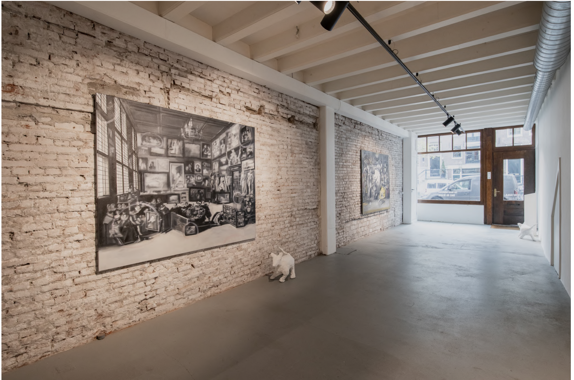
The Muse Withdraws, 2025 Installation view, Galerie Fontana.