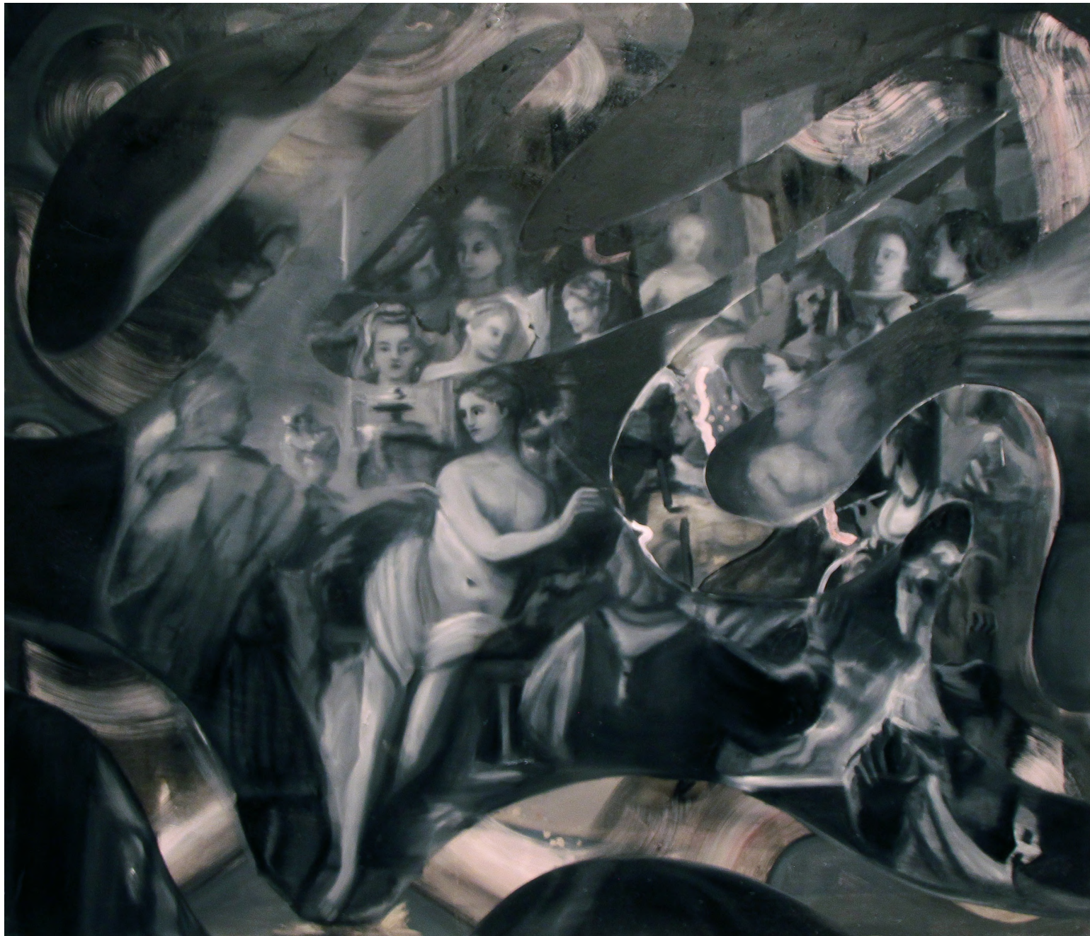
Campaspe – Version Conflict, 2025, 155 × 180 cm, oil and acrylic on canvas.

This painting is based on five seventeenth- and eighteenth-century paintings about Campaspe. Campaspe was the mistress of Alexander the Great. The court painter Apelles painted Campaspe and fell in love with her. When the painting turned out to be even more beautiful than she was, Alexander did not need her anymore. Campaspe was given away to Apelles. The story was often used to express the sublimity of painting. In my version she is given the brush and with that the power to finish her own portrait.