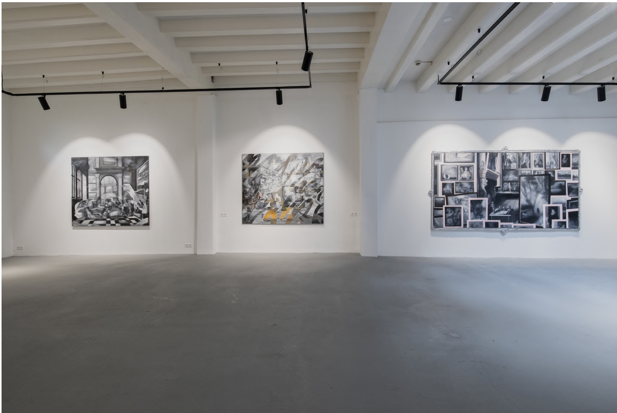
The Muse Withdraws, 2025 Installation view, Galerie Fontana.