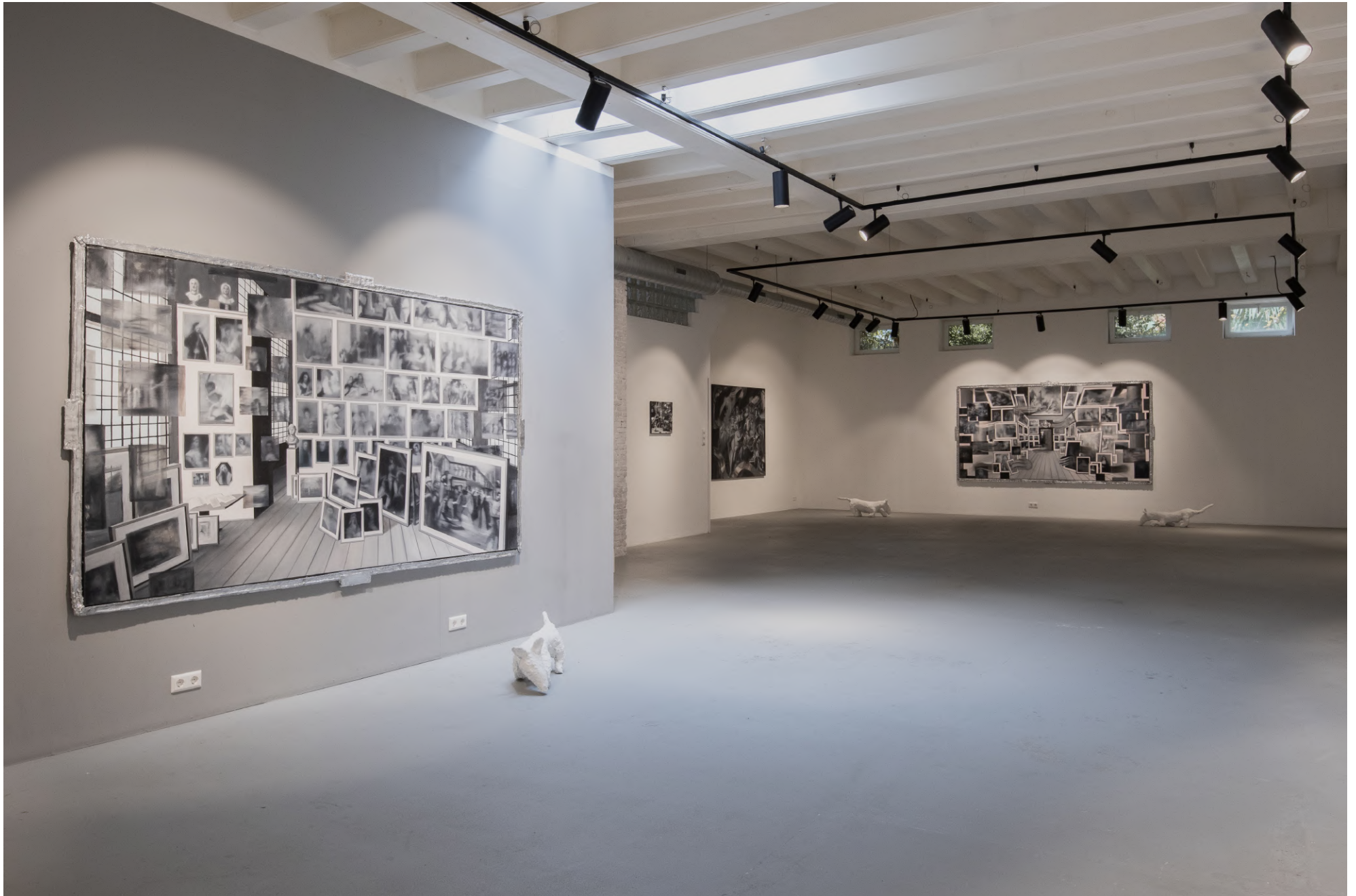
The Muse Withdraws, 2025 Installation view, Galerie Fontana.