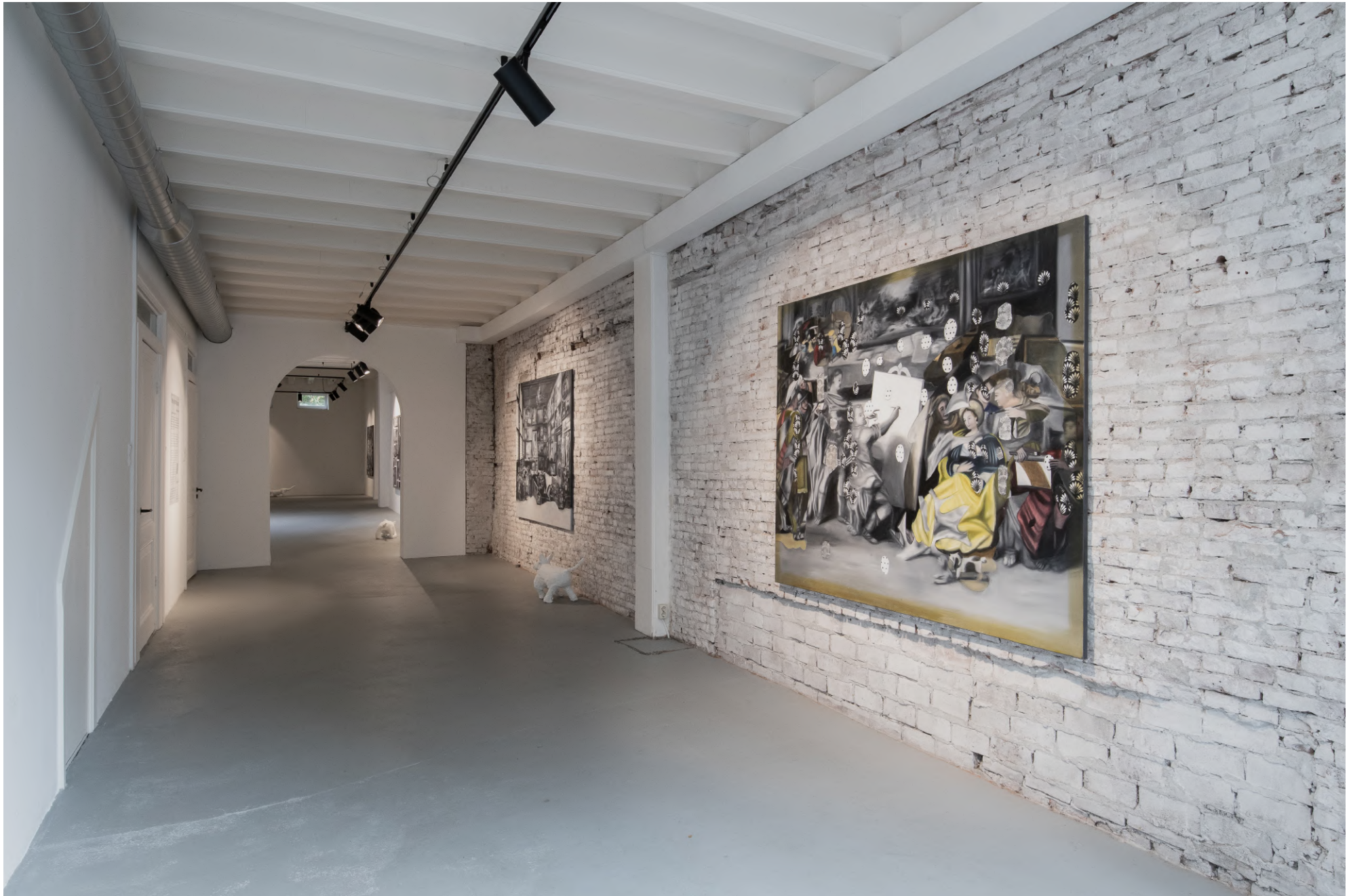
The Muse Withdraws, 2025 Installation view, Galerie Fontana.