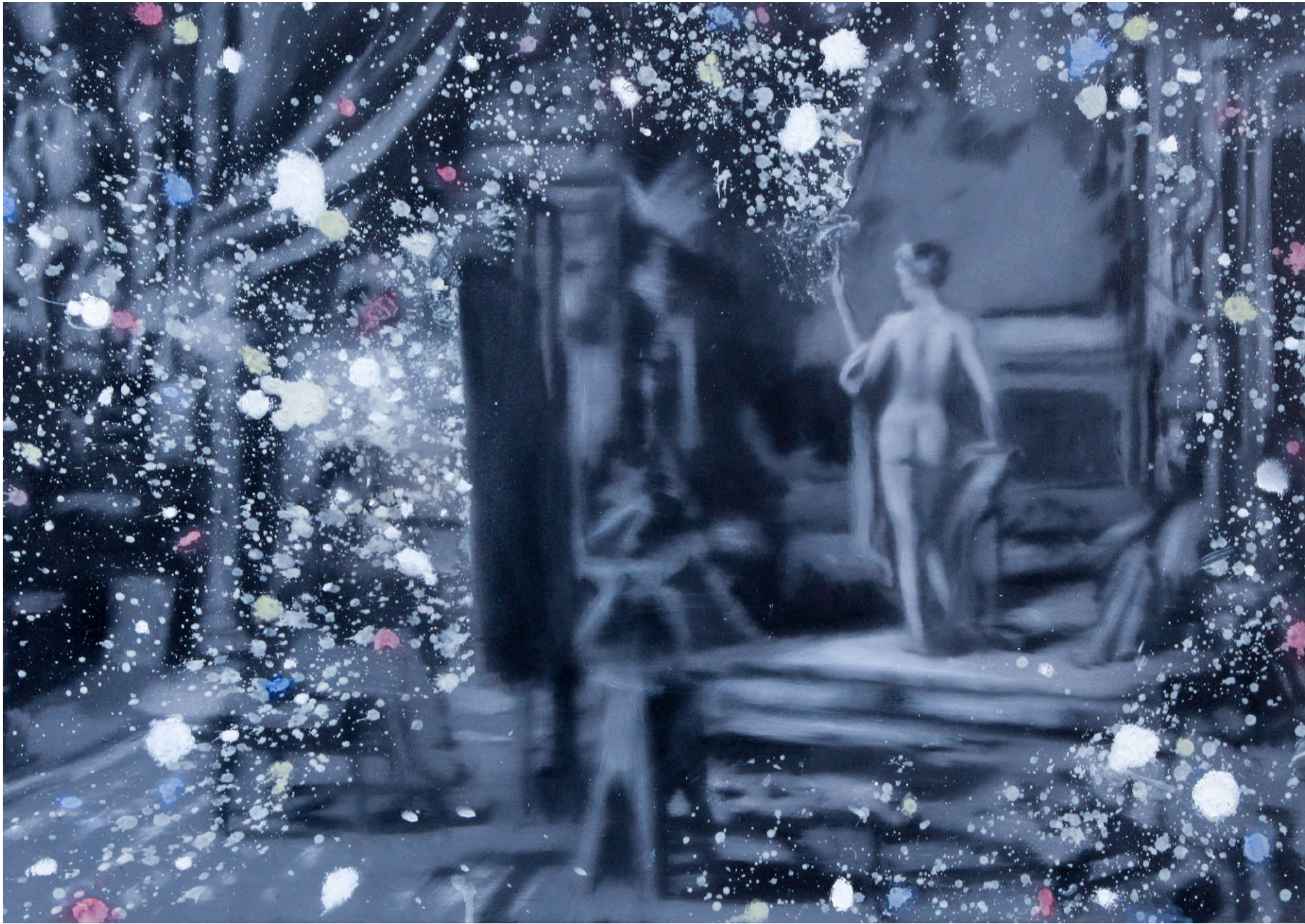
Stolen Gesture, 2026, 50 × 70 cm, oil and acrylic on canvas. After The Artist Studio by Carl Schweninger (c. 1873–1878). Loosely inspired by Adrian Ghenie's pie-fight paintings. The model takes over the image in a subtle act of resistance. As in the other works, the new maker gains control over color, atmosphere and focus, shifting the work slightly out of its historical frame.