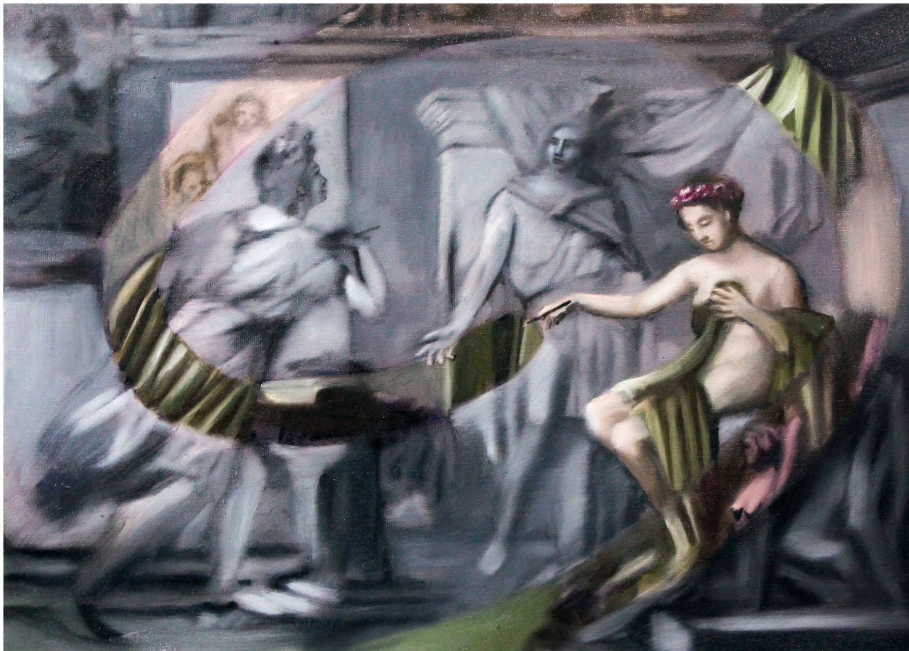
Soft Reverse, 2026, 50 × 70 cm, oil and acrylic on canvas. After Alexander Ceding Campaspe to Apelles by Jérôme-Martin Langlois, 1819. Campaspe was the mistress of Alexander the Great. Apelles paints her and falls in love. She is then given to the painter because the portrait became more beautiful than she was. In my version she colours things in, like hand-coloured black-and-white film. She paints around the men, shifting attention outside the scene, maybe like daydreaming or looking elsewhere.