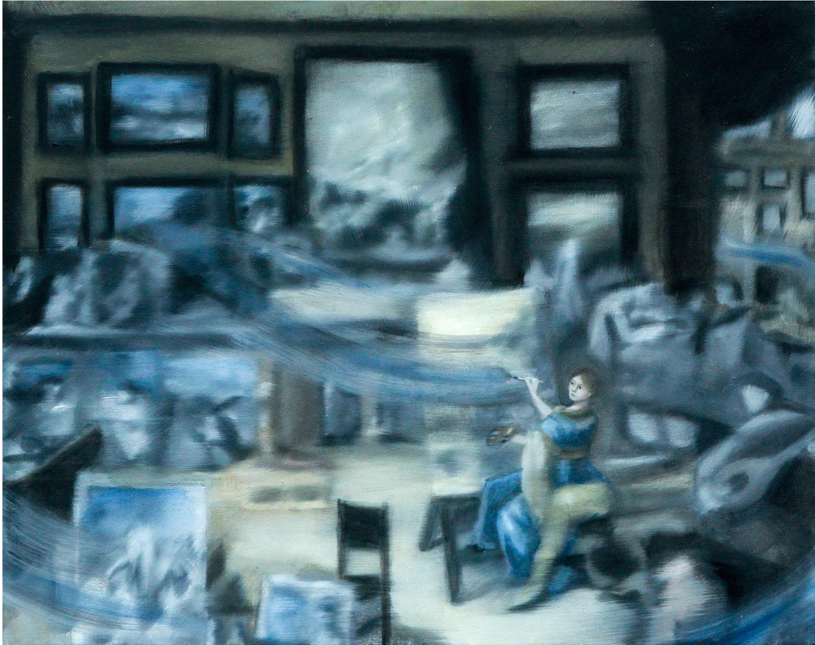
Radical unfiguring - After Frans Franken the Younger, Allegory of painting, Pictura in an Art Cabinet 1636, 40 x 50 cm 2025 The Allegory of painting finding her own personal style.