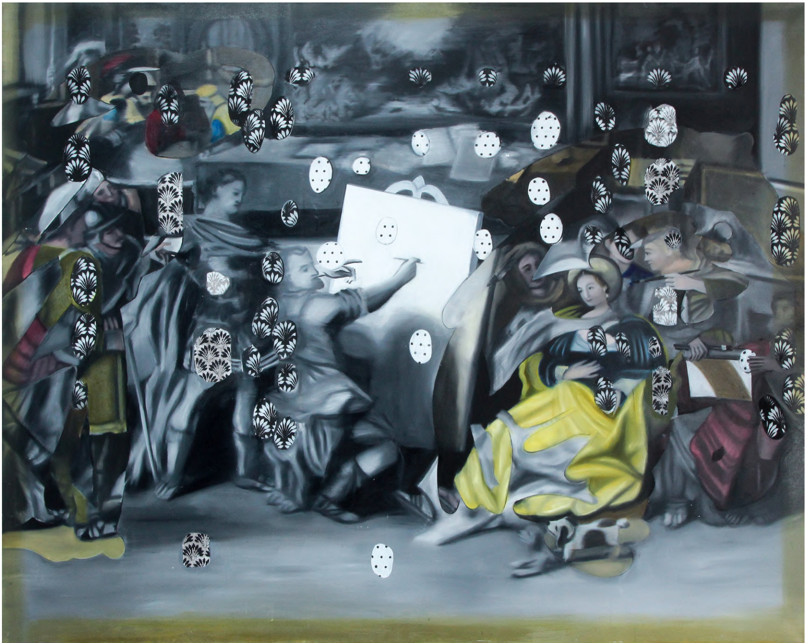
Campaspe – Image Seize, 160 × 200 cm, oil and acrylic on canvas, epoxy resin.

Again Campaspe, mistress of Alexander the Great (grey man on the left), is being given to Apelles. The original is part of a kunstkamer painting by Willem van Haecht (1630). In my version the men are no longer central. The child on the far right has been given power to make a collage, using patterns from my earlier work. The court lady behind Campaspe is given a brush with colours; she is allowed to colour people in and give them more attention. The small dog under Campaspe is reduced in scale; it stands for loyalty and good manners.