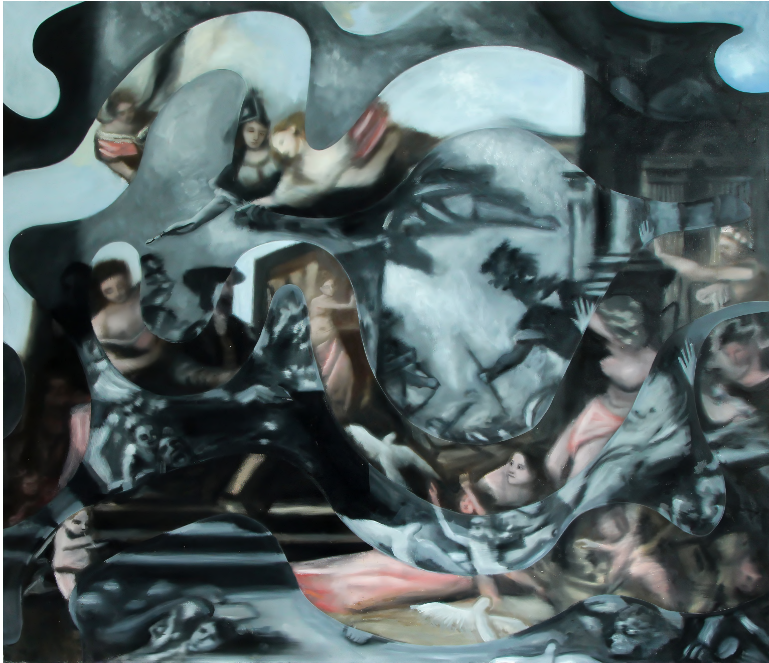
Europe Saving Face, 2026, 155 × 180 cm, oil and acrylic on canvas. After Rubens' Peace and War and Luca Giordano, circa 1660.

In my work I removed Rubens -a diplomat during his life- and I let Minerva become the painter instead. Only traces of him remain. Pax, Mars and Minerva no longer function as fixed allegories but as shifting forces: peace, war and wisdom are placed in constant tension within the image. Together they form a fragmented "Europe" —not a single figure, but a system of values that keeps changing position. While painting I thought about how geopolitical narratives are constructed through selection: what is shown, what is left out, and what is emphasised afterwards. Small scenes—violence, care, attack—appear within the painting as part of that logic. The question remains the same as in the rest of the series: who holds the brush, and what do they choose to make visible.