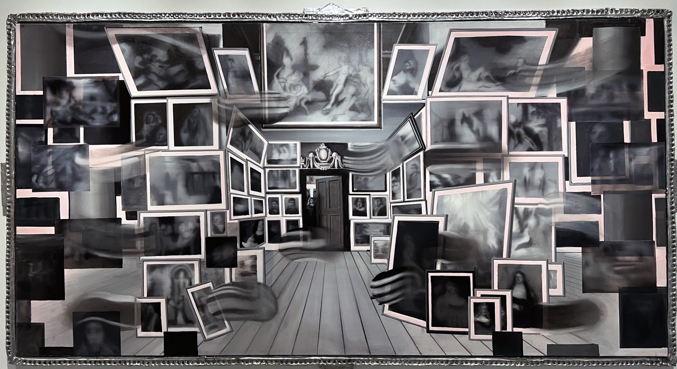
After Teniers – Establishing Novelties, 2024–2025, 155 × 300 cm, oil and acrylic on canvas, frame of air-drying clay and resin.