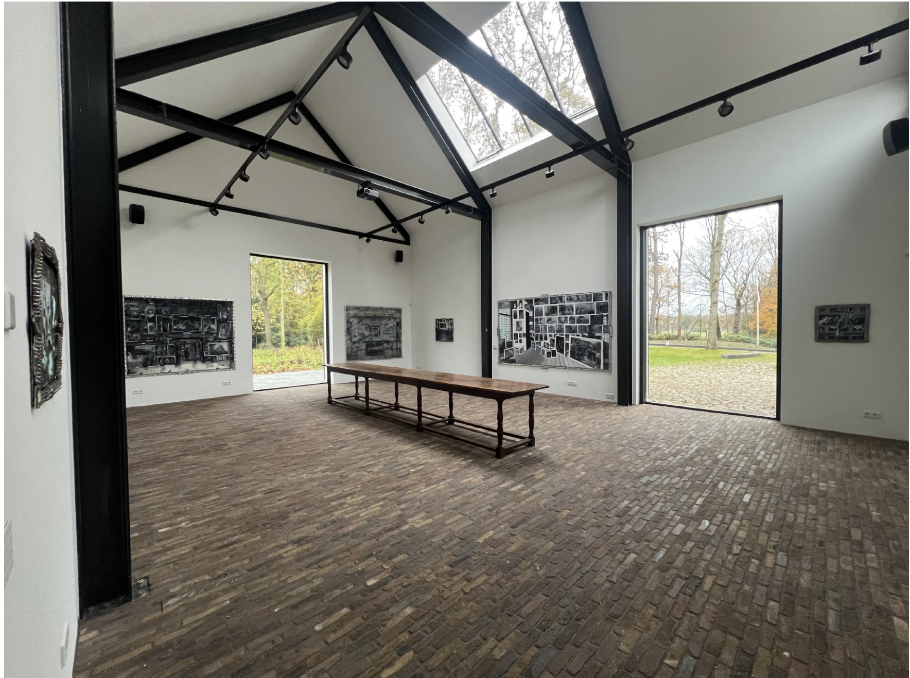
Installation view 'The viewing rooms' Poort Visser Collection, Wassenaar NL (solo)