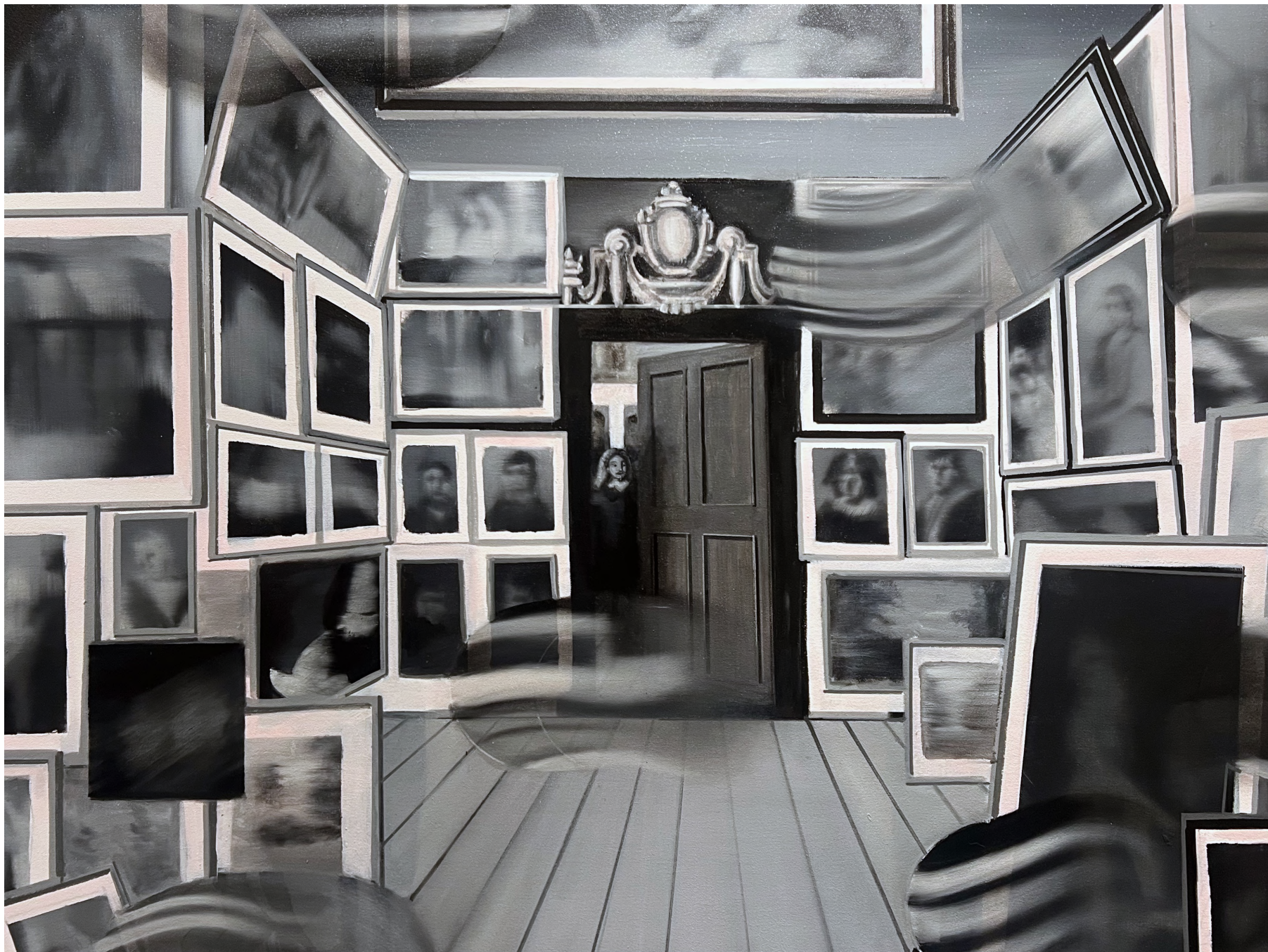
Detail After Teniers – Establishing Novelties, 2024–2025, 155 × 300 cm, oil and acrylic on canvas, frame of air-drying clay and resin. In 1651, David Teniers the Younger painted Archduke Leopold Wilhelm Visiting His Picture Gallery. Teniers was commissioned by the Archduke of the Southern Netherlands to reproduce his collection in paint. The Archduke wanted to show off what he considered the most fantastic collection imaginable. In my version, I quietly moved the Archduke to the doorway. His hat, cross and entourage have disappeared. David Teniers can still be seen holding a sheet of paper in a small painting near the centre-left. People often disappear in my work in an attempt to strip patrons of their power. Sweeping marks run across the painting, almost as if the collection is being swiped away on a screen.