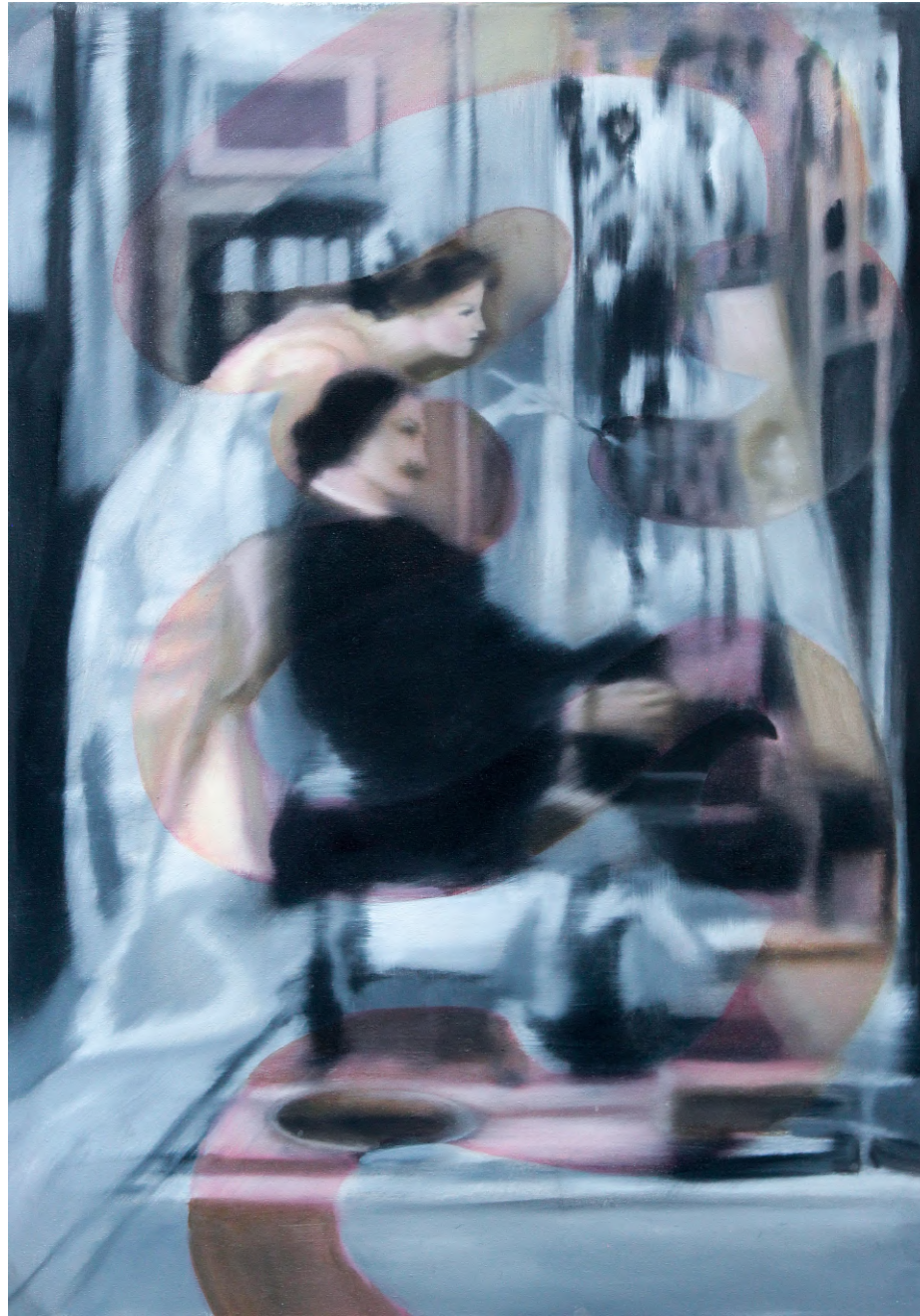
The In-Between Gaze, 2026, 70 × 50 cm, oil and acrylic on canvas. After Le peintre et son modèle by Alfred Stevens, 1855. Again a painter and a model, but here the brush is given to the model. She paints together with him; he is also in colour. They are looking at the portrait she is making of herself. It becomes a kind of painting marriage, or a warm relation between equals.