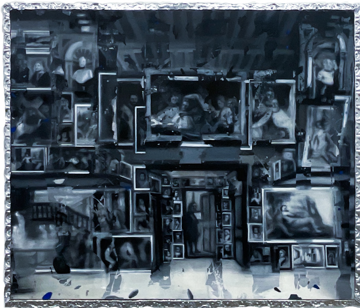
After Teniers – Mending Passages, 2024, 155 × 180 cm, oil and acrylic on wood.

Again based on Teniers work about the Archduke's collection. Here the Archduke appears in fragments of his own collection. I see him overwhelmed by it, as if the collection itself took over control.