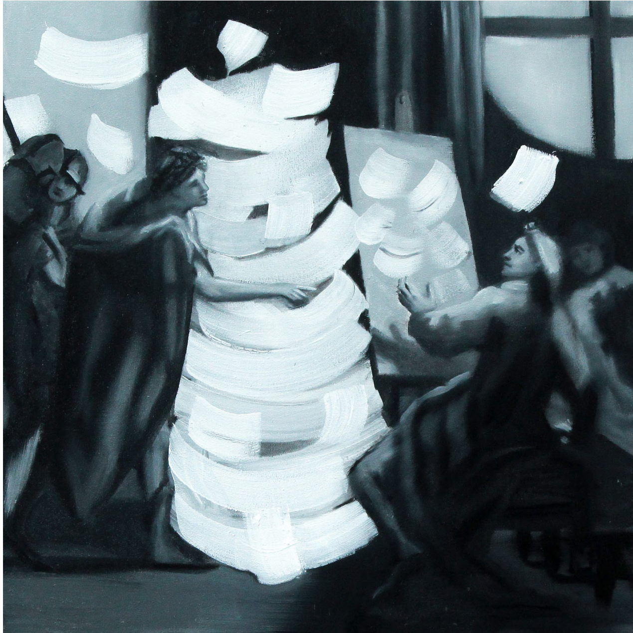
Muse Revolt – Campaspe Study, 2025, 40 x 40 cm, oil and acrylic on canvas.

This painting is derived from Alexander Presenting Campaspe to Apelles by Gandolfi, 1793.